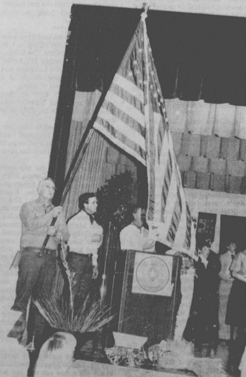
Ole Glory in Gruver