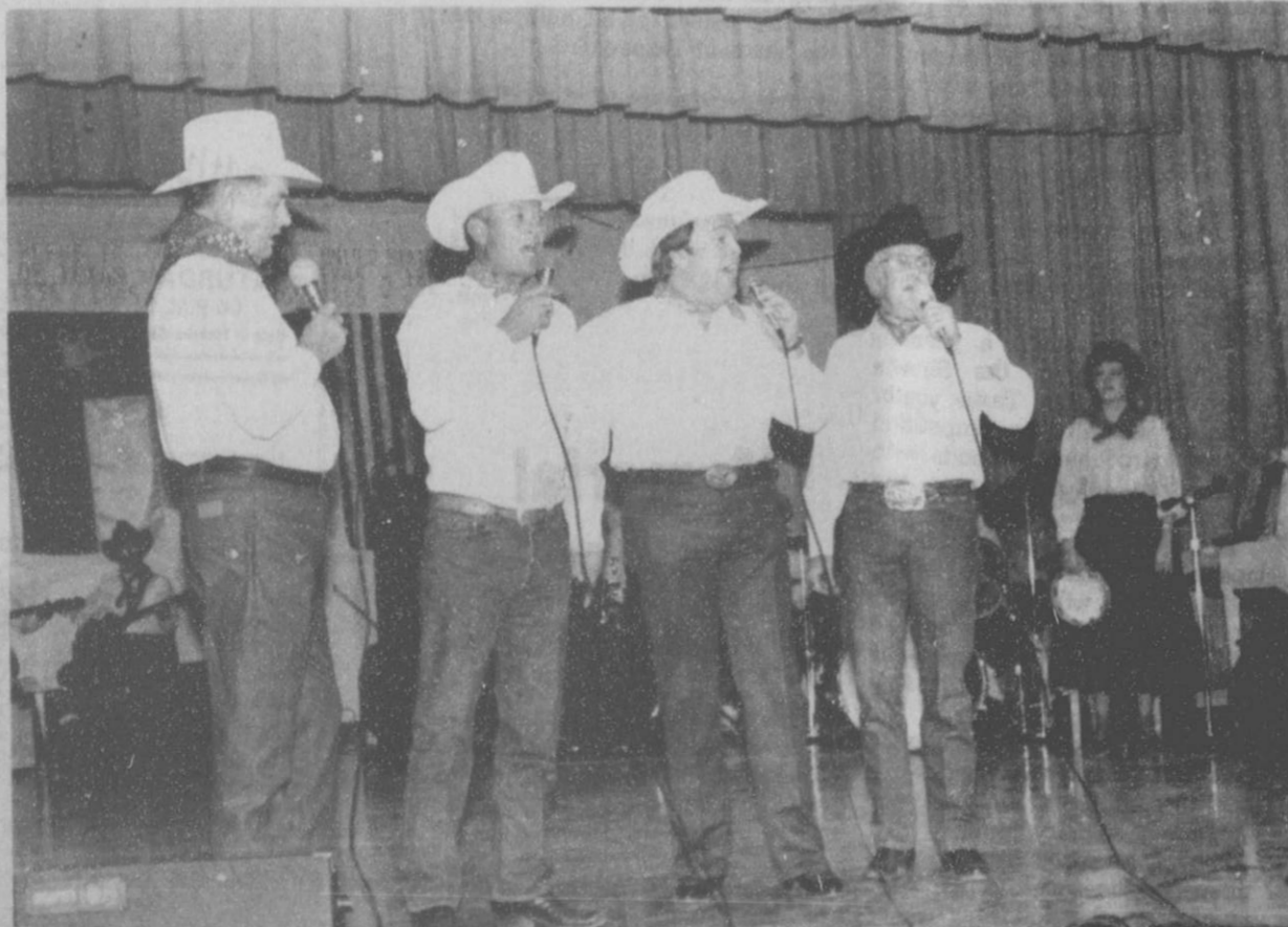
The Gruver Methodist Men Quartet, dubbed as Nephews of

The Gruver boys are still in the running for a playoff spot. If they beat Darroulette at Darroulette Friday night, they will be in a three-way tie for a play off spot with Darroulette, Booker and Gruver! This could happen, if Gruver beats Darroulette at Darroulette Friday night!