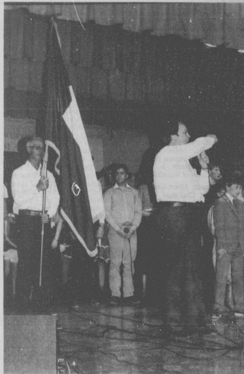
The Texas flag flies at Gruver