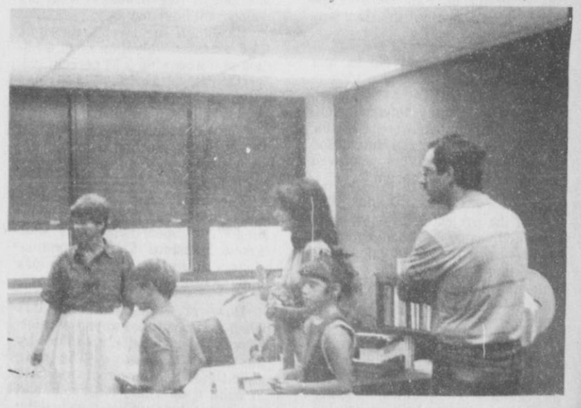
New Jr. High Building