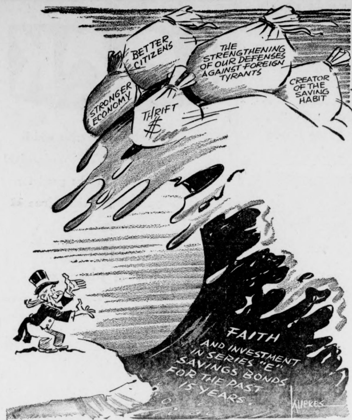
BREAD UPON THE WATERS