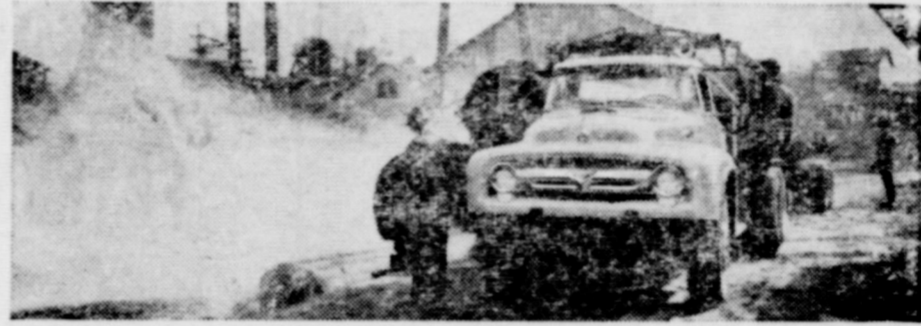
"I earn as much as $30 a day more because my Ford T-800 tandem job can carry more payload than comparable trucks," says timber-hauler Clarence Landwing.