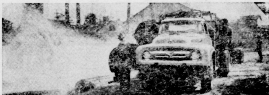
"I earn as much as $30 a day more because my Ford T-800 tandem job can carry more payload than comparable trucks," says timber-hauler Clarence Landwing.