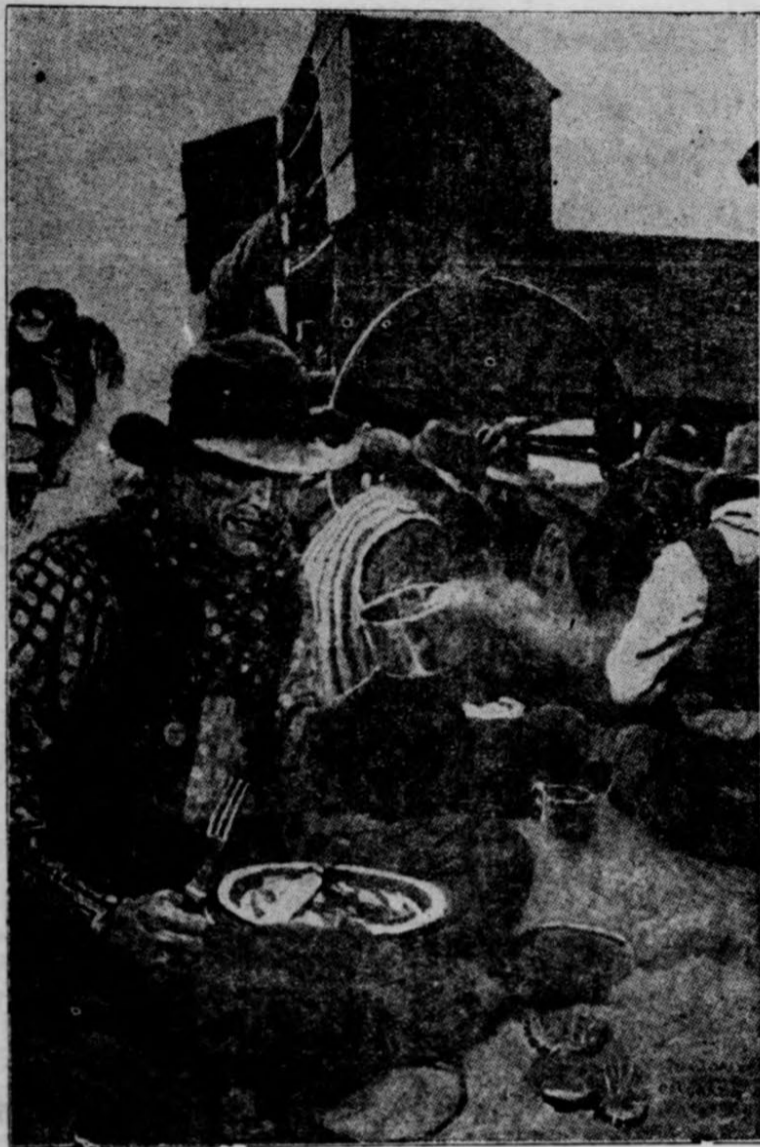
(From a drawing by N. C. Wyeth in Scribner's Magazine.)

Ever eat beans ("Mexican strawberries") dished up from a chuck wagon? Ever sleep out with a saddle for a pillow? It's a great life—if you like it, say the cowboys.