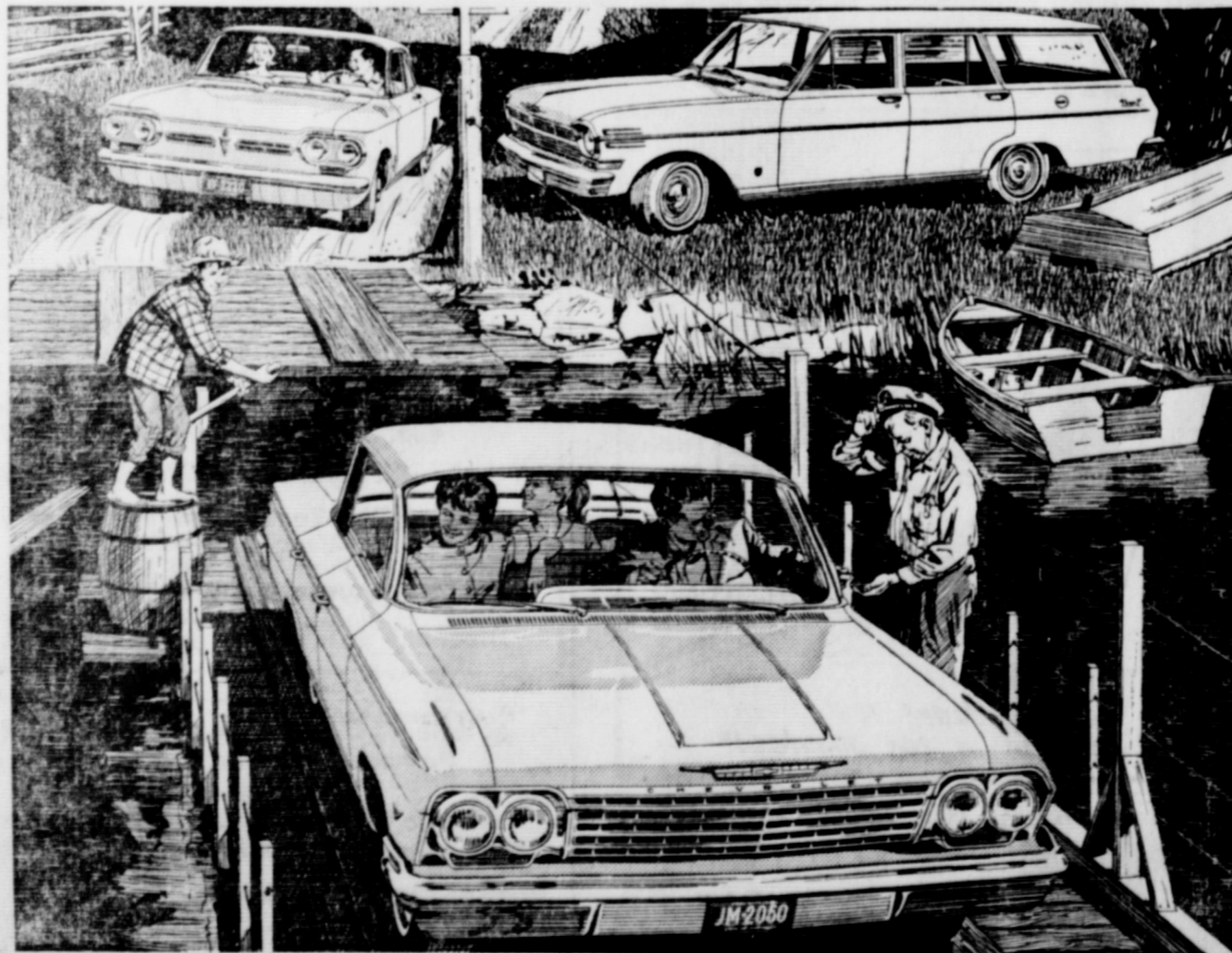
See the new Chevrolet, new Chevy II and new Corvaire at your local authorized Chevrolet dealer's

Corvaire If you spark to sporty things this one ought to fire you up but good. With the engine weight astern, the steering's as responsive as a bicycle's and the traction's ferocious. As for the scat—wow! At the ramp: the Monza Club Coupe.