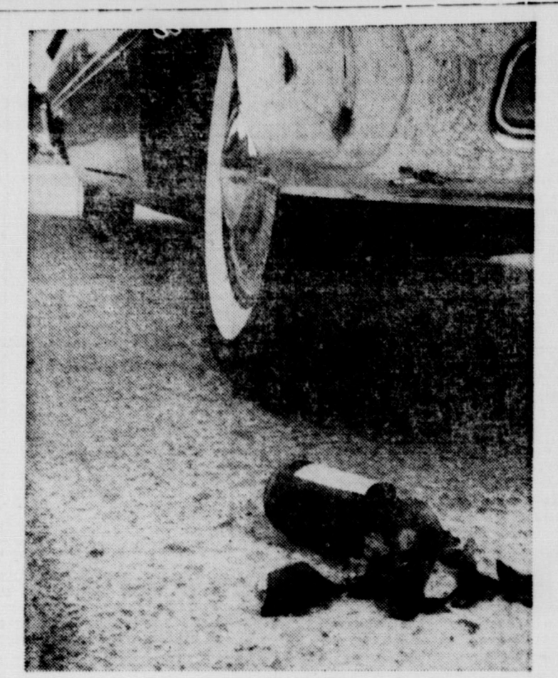
BROKEN BOTTLES: "TRIPLE THREAT" ON OUR HIGHWAYS A triple threat on the football field is fine, but a triple threat on the highway spells trouble.