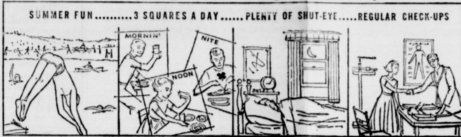
The National 4-H Health program sponsored by Cooperative Extension Service and Eli Lilly and Company.