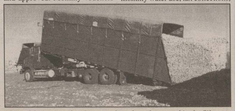
Most of the corn and maize crops have been harvested in the Silverton area, and farmers are very busy stripping their cotton at this time. Gins in the area have a lot of modules on their yards, and module hauling trucks are making a constant procession along the highways to pick up finished modules.