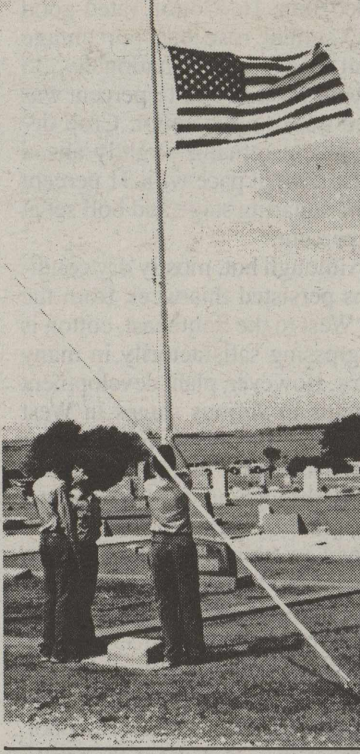
Three Scouts raised the flag while the others stood at attention and saluted during the Memorial Day service at the Silverton Cemetery.

When the fryer heating light goes off, signaling that the oil shrimp into the batter and place in els and serve immediately.