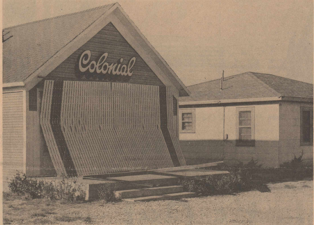
Cold Winds Bring Down Hot Wires

IT WAS COLD AS BLAZES HERE Saturday as winds of about 70-mph blew down electrical lines and sent sparks flying when the 2,400 volt lines got together. The lines came down on main street and the flashes damaged tires on autos owned by Howard Hall and G.T. Sides. People watching the sparks naturally kept their distance. Proof of the high winds was found also at Colonial Beauty Salon, where an awning was blown down.