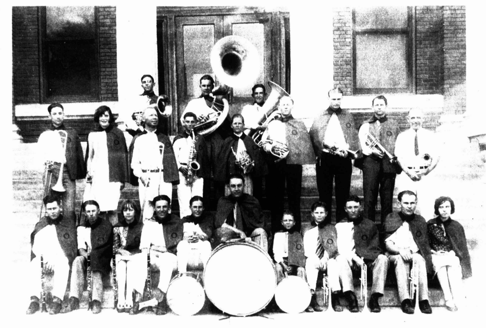
TAHOKA MUNICIPAL BAND 1928 - Tahoka Museum