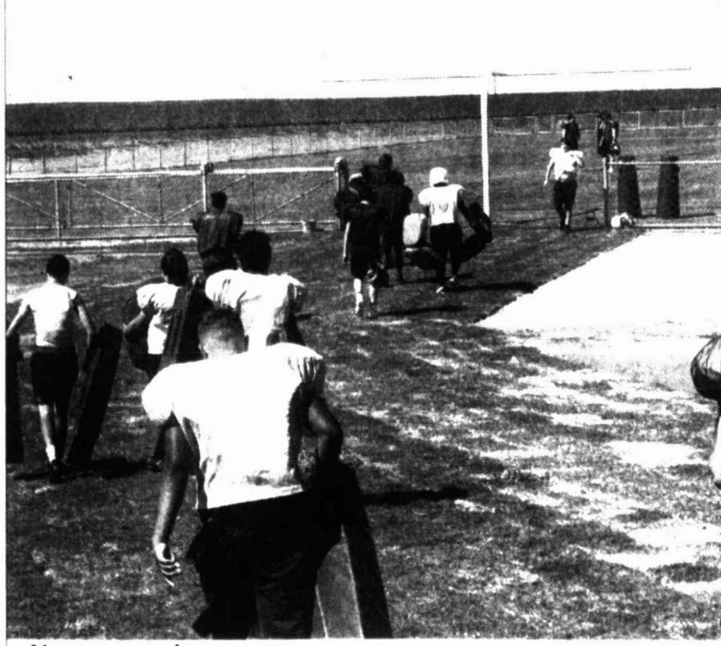
New grounds ... Tahoka Football players are practicing at the new facilities on North 5th St.

Lynn County Jail held 32 in-County, and one each for Cochran, Dawson and Floyd counties. Lynn County is also currently housing 4 inmates out of the county, with two females in Terry County, and two females in Scurry County (due to limited space for housing female inmates in Lynn County).