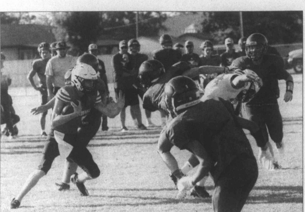
Stampede!... A herd of Farwell Steers have the New Home quarterback surrounded during last week's scrimmage in New Home. The Leopards' season opener is on the road this Friday, against Compass Academy.

Celebrate National Dog forts. good for us. Numerous stud- Day by adopting a deserving ies have determined that the dog from a local shelter or respresence of pets is beneficial cue group. If you aren't ready for our physical and mental to adopt, you can certainly help by fostering.