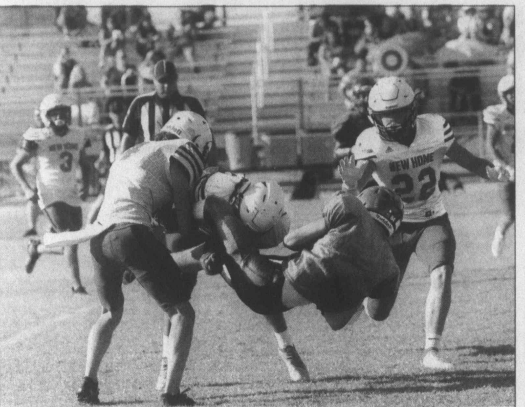
Up in the air... The New Home Leopards had their second scrimmage of the year against a talented Farwell team at the New Home field last Thursday. The Leopards are on the road this week for their season opener against Compass Academy. Their first home game is Sept. 3, hosting Lubbock Roosevelt.

to adopt or foster a dog because canine company is just health. The companionship of animals has been shown to reduce stress, lower blood pres- ter or adopt, you can still celsure and lessen anxiety, helping people to feel calmer and