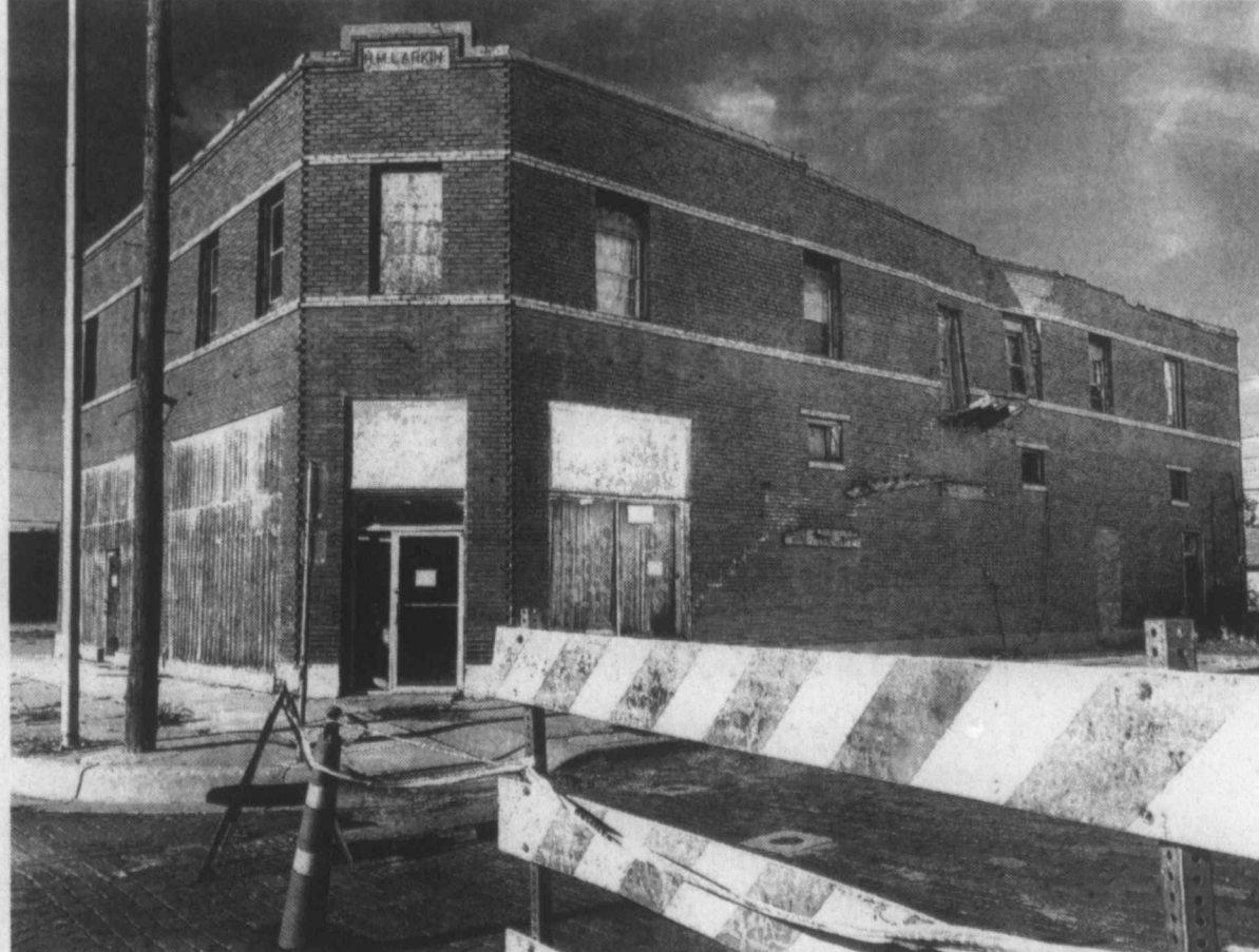
Unsafe ... This building, on the corner of South 2nd and Ave. J, on the southwest corner of the square in Tahoka, will soon be torn down, after it was deemed unsafe by the City of Tahoka. Demolition is expected to begin next week. Its history dates back to 1916.

the building near the roof. According to information from "Grassroots Upside Down: A History of (See DEMOLITION, page 3)