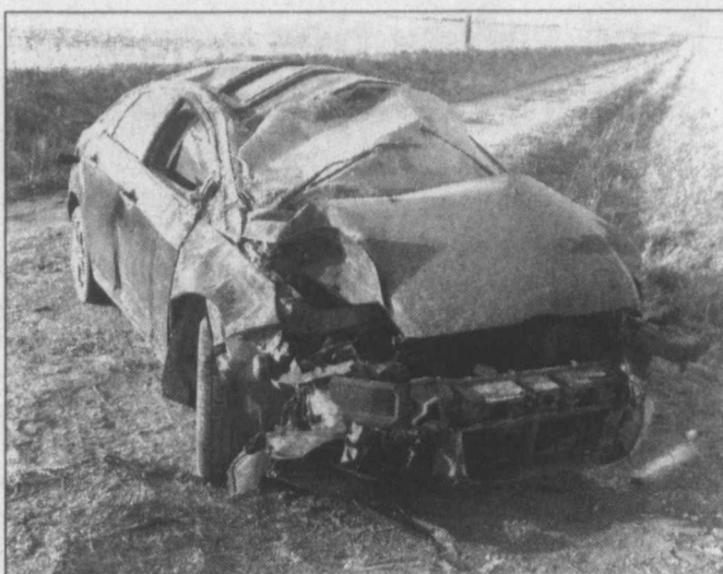
Crushed ... The crushed remains of a single-vehicle rollover were recovered at 6:12 a.m. Friday, June 12, after it rolled several times near the intersection of FM 212 and FM 211. The inset photo shows a motor that was found outside the vehicle. A male driver was reported as the only person in the vehicle, and he was transported to the hospital for treatment of unknown injuries.

Lynn County Jail held 24 inmates during the week, including 9 held for Ector County and 15 for Lynn. Local charges included one for driving while intoxicated 3rd or more offense, and one for sexual assault.