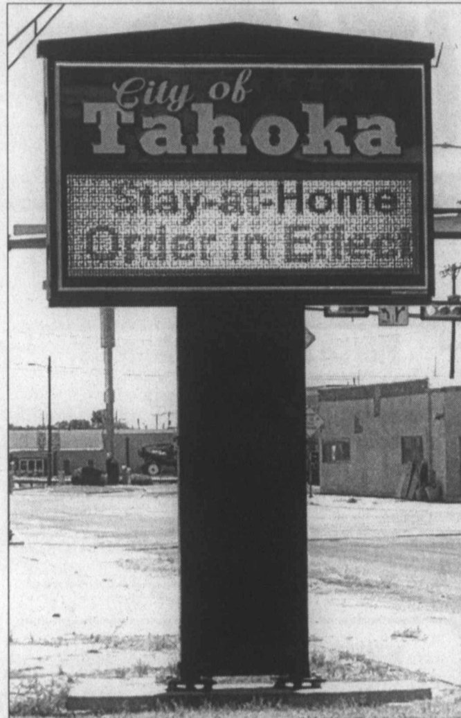
Stay at home ... After several new cases of COVID-19 were reported last week in Tahoka, the City of Tahoka issued a Stay-at-Home Order to go into effect immediately, asking citizens to stay home except for essential needs. See story for more information.