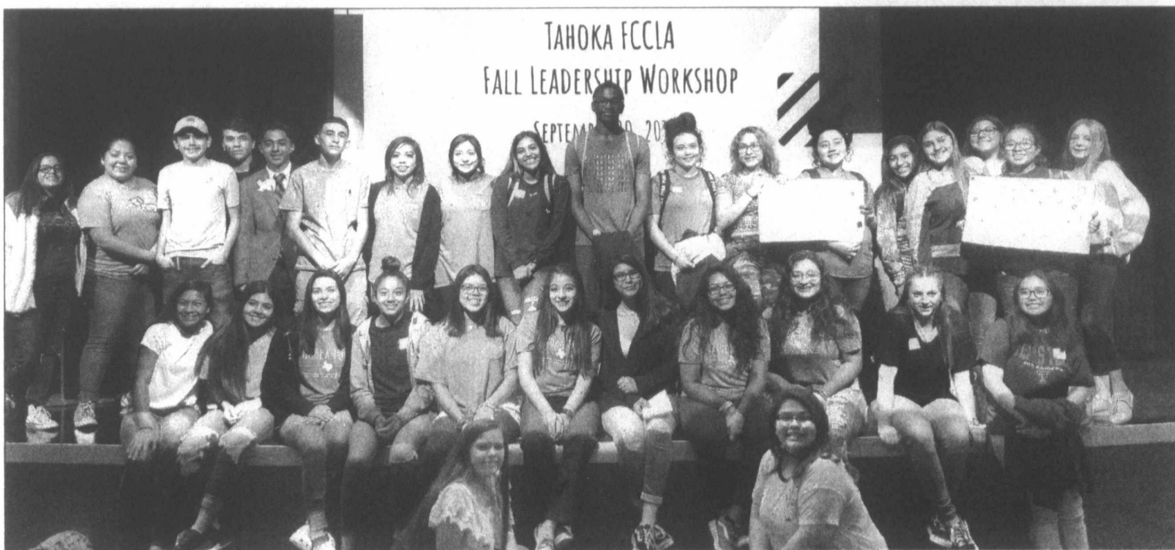
Leadership workshop ... Tahoka High School Family, Career and Community Leaders of America members and officers hosted a Leadership Workshop here on Monday. Approximately 225 students and advisors traveled from all around the area for the event.

This year, FCCLA will be celebrating its 75th Anniversary and in the spring, Tahoka FCCLA will be hosting a traveling display of shadow boxes filled with rich history of Home Economics, Future Homemakers of America, up to the current FCCLA program. Dates and times for the display are to be determined, but all past students, members, and officers are welcome to attend.