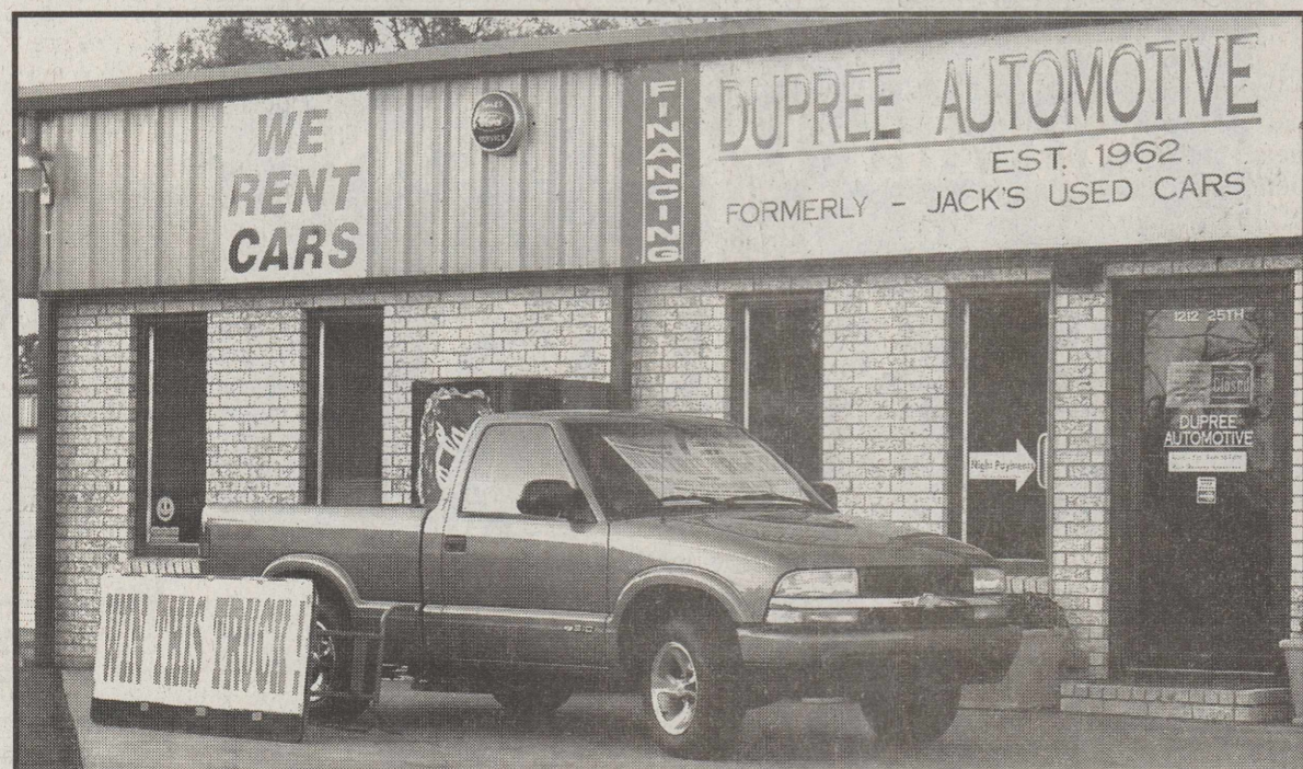
A great way to support the WTC baseball and softball programs!