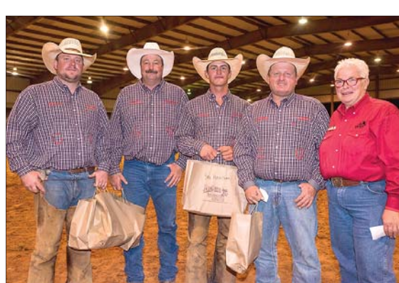
Pictured here the Detwiler Cattle/Heck Cattle Team from Childress and Clarendon won 3rd place last week at the 2018 Big Bend Rodeo in Alpine