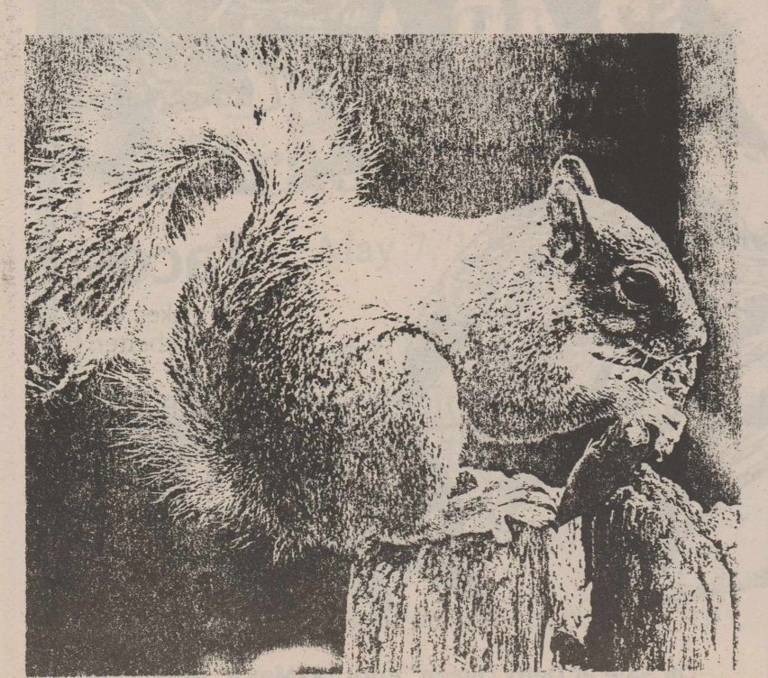
"PLEASE HELP US! We, the Squirrels of the Yoakum County Courthouse, have run out of nuts. If you have any old pecans or peanuts you can't use, please bring them to the courthouse for us to eat. We appreciate your help a bunch!"

Report Child Abuse or Neglect call 1-800-252-5400