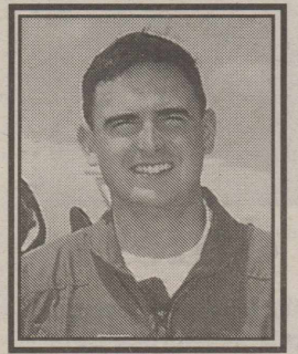
Hometown: College Station, Texas College: Texas A&M University Aircraft Assignment: C-21, Maxwell AFB, Ala.