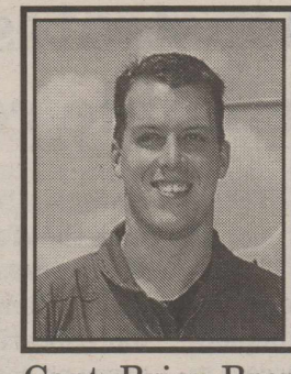
Hometown: Olympia, Wash. College: Central Washington University Aircraft Assignment: C-141, McGuire AFB, N.J.