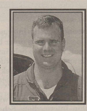
Hometown: Irving, Texas College: Southeastern Oklahoma State Aircraft Assignment: C-130, Oklahoma City