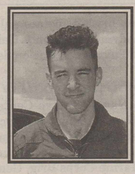
Hometown: Spokane, Wash. College: Air Force Academy Aircraft Assignment: A-10, Davis Monthan AFB, Ariz.