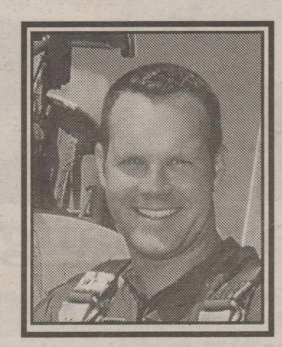
Hometown: Modesto, Calif. College: California State University Fresno Aircraft Assignment: A-10, Davis-Monthan AFB, Ariz.