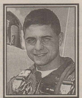
Hometown: San Jose, Calif. College: Air Force Academy Aircraft Assignment: F-16, Luke AFB, Ariz.