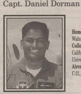
Hometown: Walnut Creek, Calif. College: California State University, Hayward Aircraft Assignment: C-21, Langley AFB, Va.