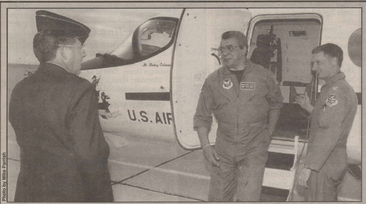
Assistant SECAF gets Jayhawk orientation ride

A separate checking account is maintained and is zeroed out at the end of each year's CFC, she said.