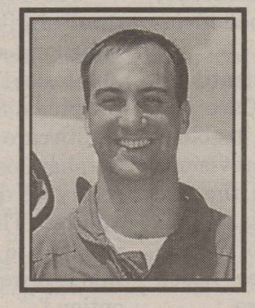
Hometown: Reynoldsburg, Ohio College: Ohio State University Aircraft Assignment: T-37, Laughlin AFB, Texas