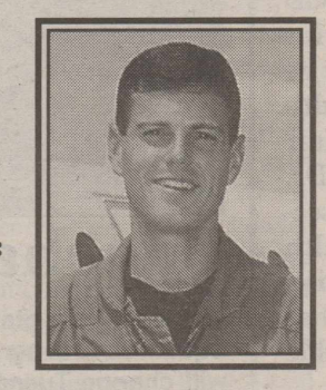
Hometown: Houston College: University of Texas Aircraft Assignment: T-37, Vance AFB, Okla.