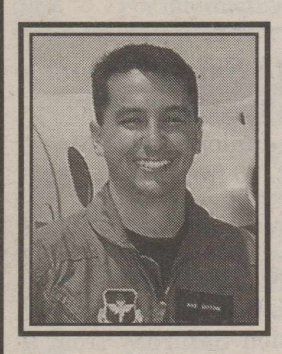
Hometown: Davie, Fla. College: Florida State University Aircraft Assignment: MC-130, Ft. Walton Beach Fla.