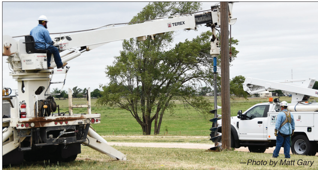
LABOR AND EQUIPMENT DONATED: Greenbelt Electric Coop workers pull old light poles to make way for dirt work to rework baseball fields at Tom Britt Memorial Park Wednesday, May 20, 2020.

fields have been discussed for several years now. The ideas and plans have changed and evolved over time for one reason or another due to a lack of funding, manpower, and/or inopportune timing. We (Continued Page 3)