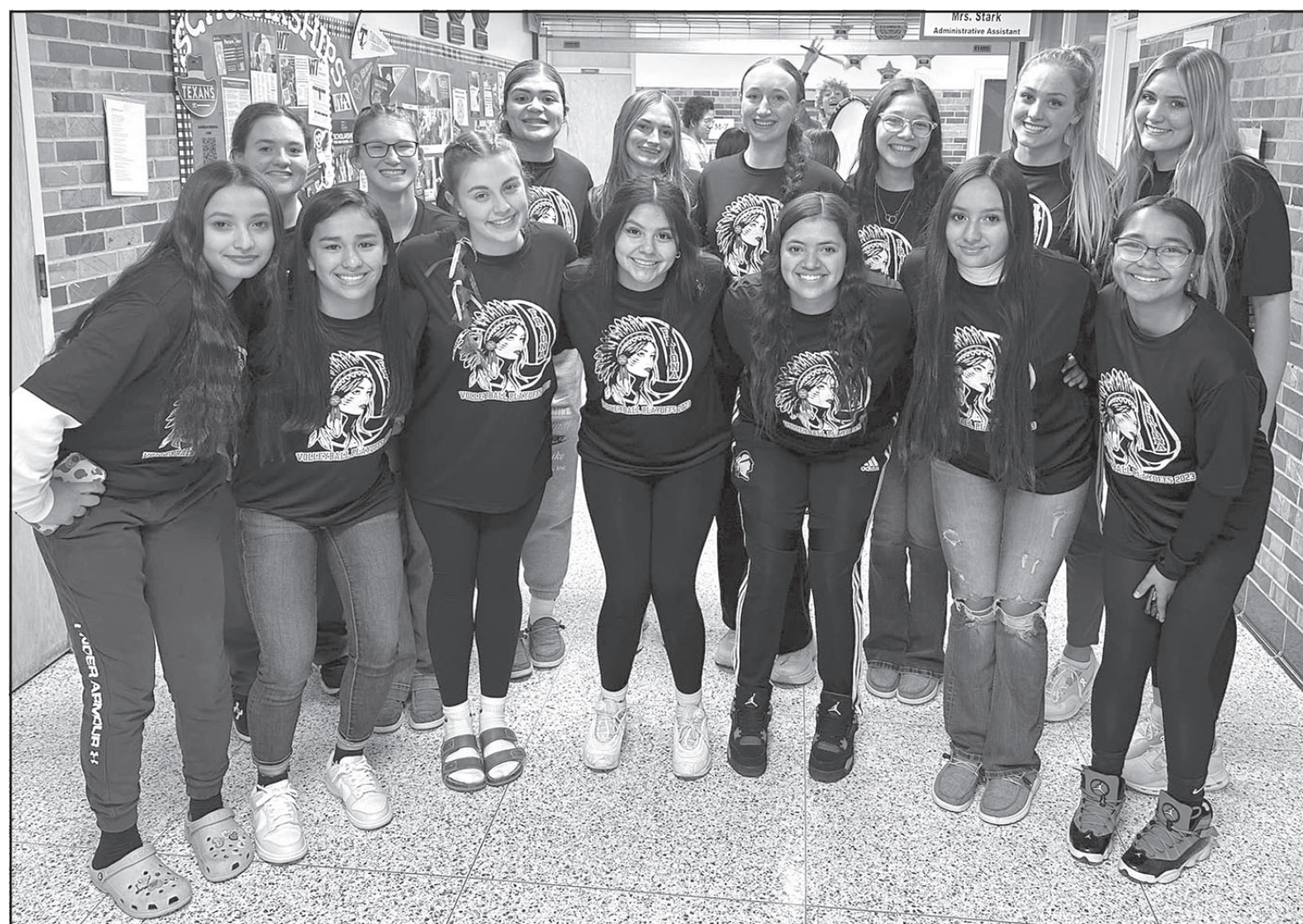
2023 Friona Squaws Volleyball Team | Record: 32-10 | Bi-District Champions