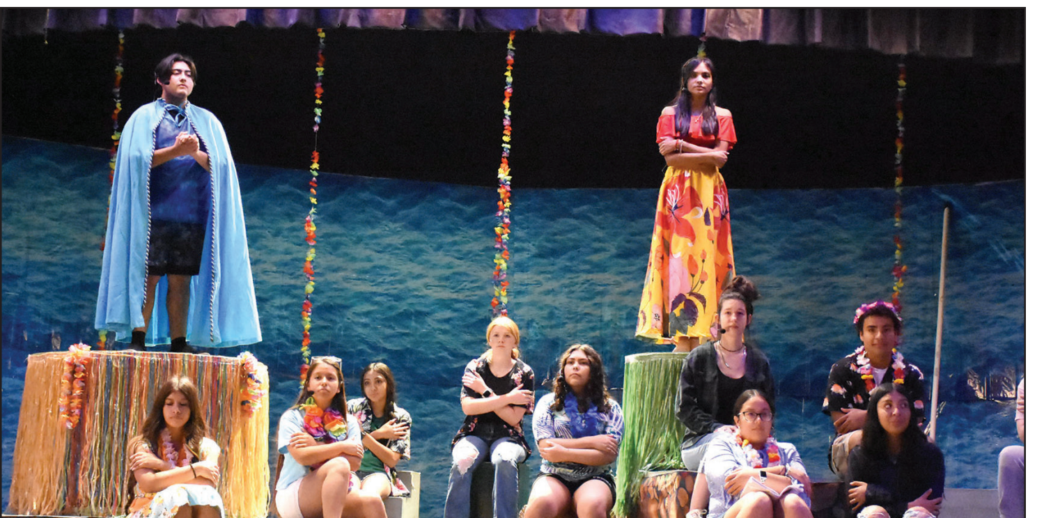
Coming to a Theatre Near You — The cast and crew of FHS Theatre have been hard at work putting the finishing touches on this year's musical, Once on This Island . Performance dates and times are listed at left.