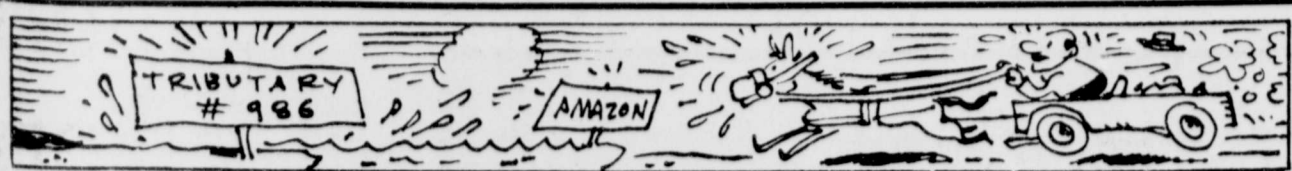
The Amazon River has 1,100 tributary streams.