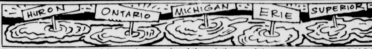
The names of the five great lakes can be remembered through the use of the mnemonic device: H-O-M-E-S. Huron, Ontario, Michigan, Erie, and Superior.