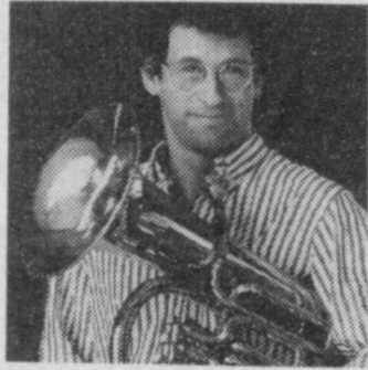
He invests his time in music and his money in U.S. Savings Bonds.