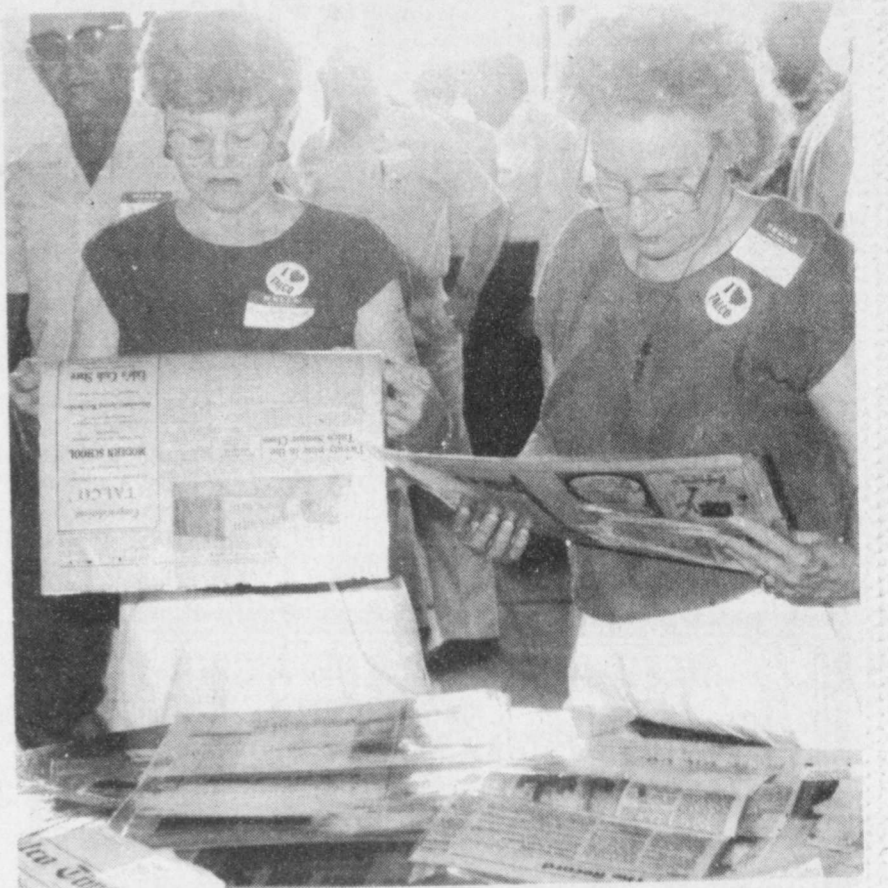
THE TALCO TIMES-Old and new, was a popular attraction at the Talco Homecoming last Saturday. Approximately 400

Next year, the school will celebrate its 50th anniversary and everyone should make plans to attend.