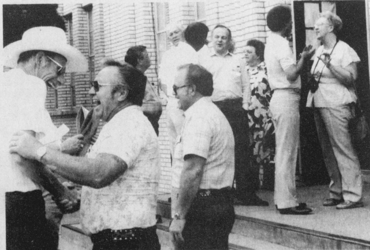
TALCOREUNION-The lunchroom was packed as a barbecue lunch was served during the