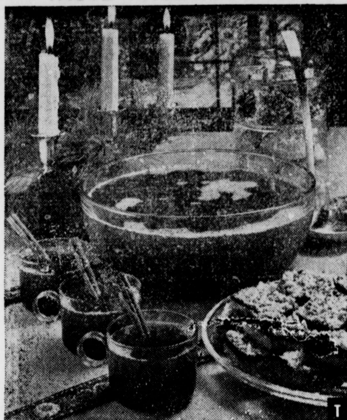
After a day of skiing or skating, a tart, tangy, spicy hot cranberry punch is a taste treat that is sure to be the hit of the party.

Home economists at the Corning Glass Works test kitchens suggest this non-alcoholic recipe for cranberry punch—ideal for holiday entertaining. It should be served from heat-resistant glass punch bowls that can be warmed in the oven—a Pyrex ware sculptured toddy bowl being appropriate. The ingredients are: