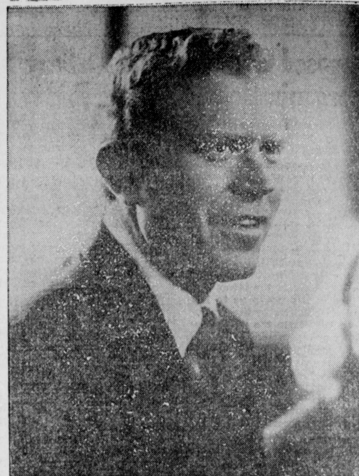
LIUTENANT GOVERNOR BEN BARNES PUBLIC SERVICE

Elective Offices 1960 - Elected to House of Representatives from District 64 at age 22 1962-1964 - Re-elected to House without opposition 1965 - Elected Speaker of the House 1967 - Re-elected Speaker. Youngest Speaker in Texas history to serve two terms 1968 - Elected Lieutenant Governor by more than two million votes, 72 per cent of the total vote cast and the largest ever polled in the history of Texas elections 1970 - Re-elected Lieutenant Governor by impressive margin