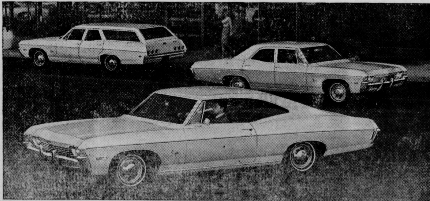
Impala Sport Coupe (foreground), 4-Door Sedan, Station Wagon