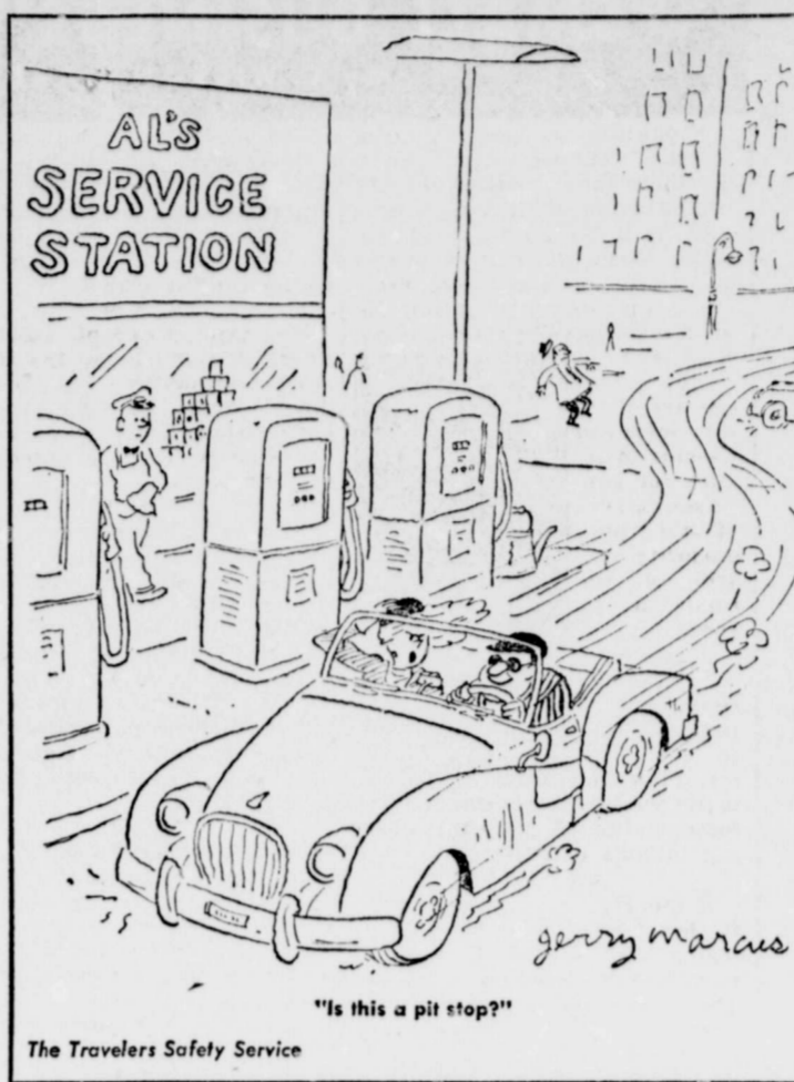
Speeding killed 16,400 and injured 1,344,000 in 1964.