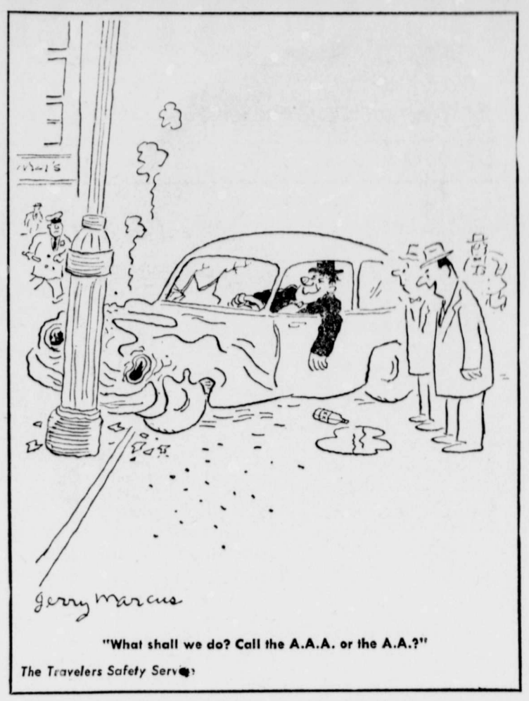
Driving after drinking is the root of a high percentage of highway accidents.