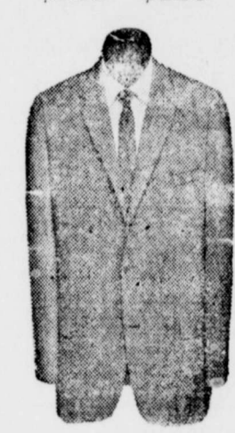
Hart Schaffner & Marx

Try one on and experience the difference. The best known suit in town in new