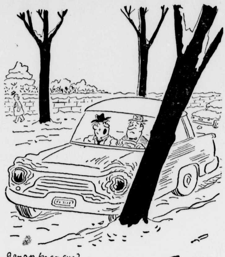
"Let me off at the next accident, will you, Ed?" The Travelers Safety Service Driver error is involved in 4 out of 5 highway accidents.