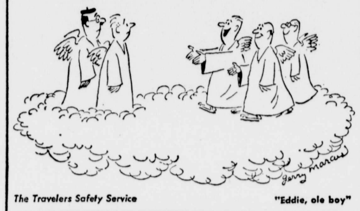
The Travelers Safety Service