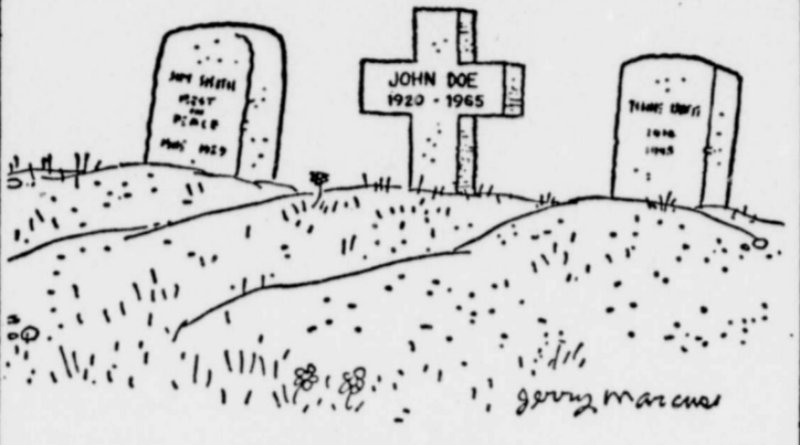
Cross in the middle.

The Travelers Safety Service Crossing between intersections killed or injured almost 90,000 persons in 1964.