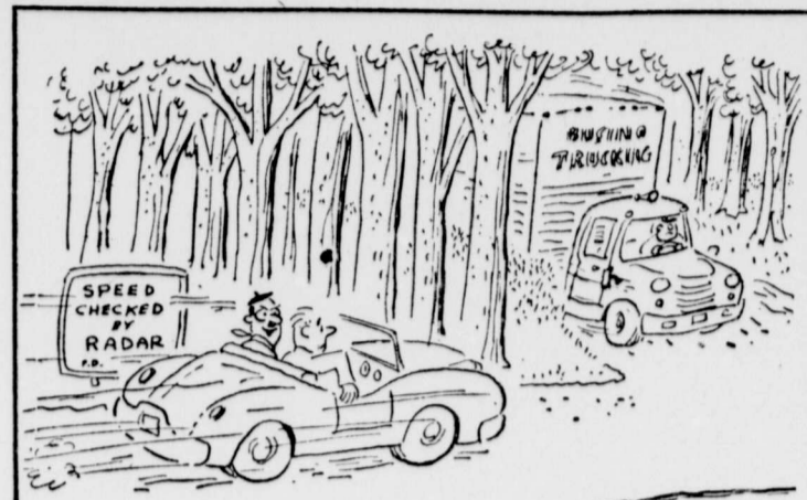
"Don't worry—I never get in trouble—I've got friends in high places."