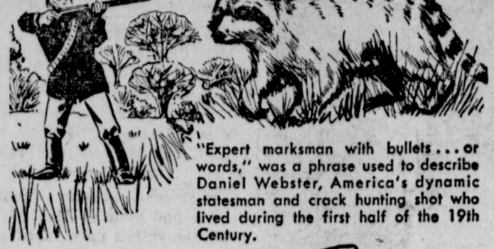
"Expert marksman with bullets... or words," was a phrase used to describe Daniel Webster, America's dynamic statesman and crack hunting shot who lived during the first half of the 19th Century.