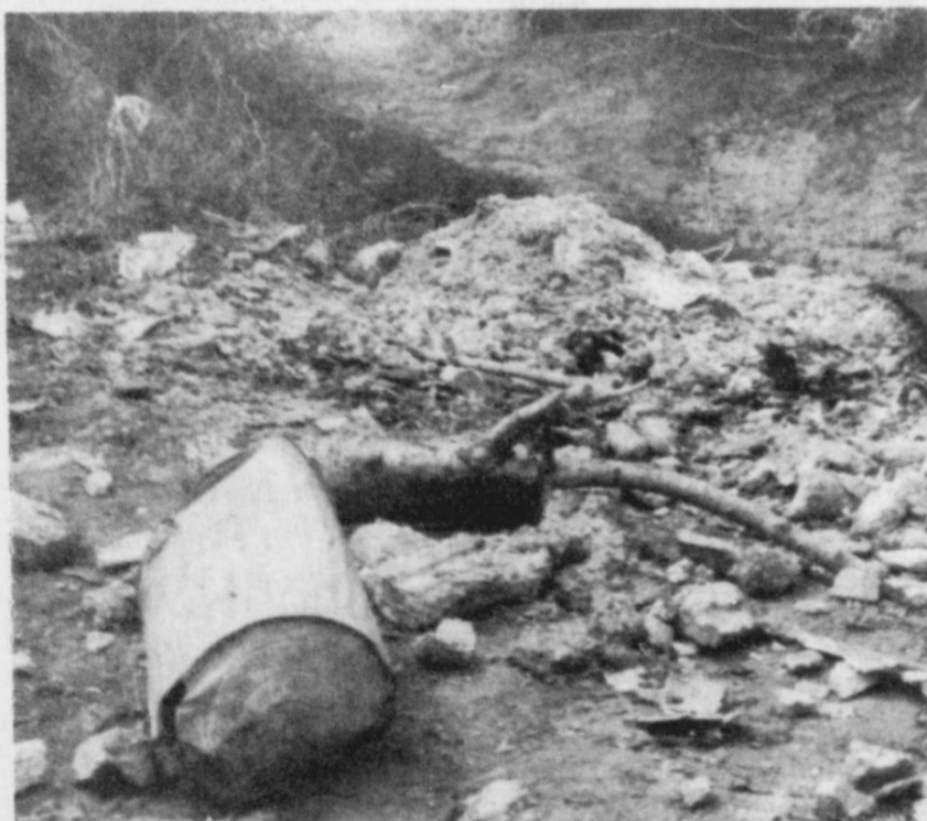
DUMPING-has become a problem along creeks, ditches and county roads. A health hazard, danger to wildlife and an eyesore, it may also become more expensive to those who get caught as fines will be imposed.

The temptation to say "but there was already a lot of junk here" is great. Remember, though, adding to the problem can be costly...and is not necessary. Like the state highway department's litter campaign, the county says "Don't mess with Texas".