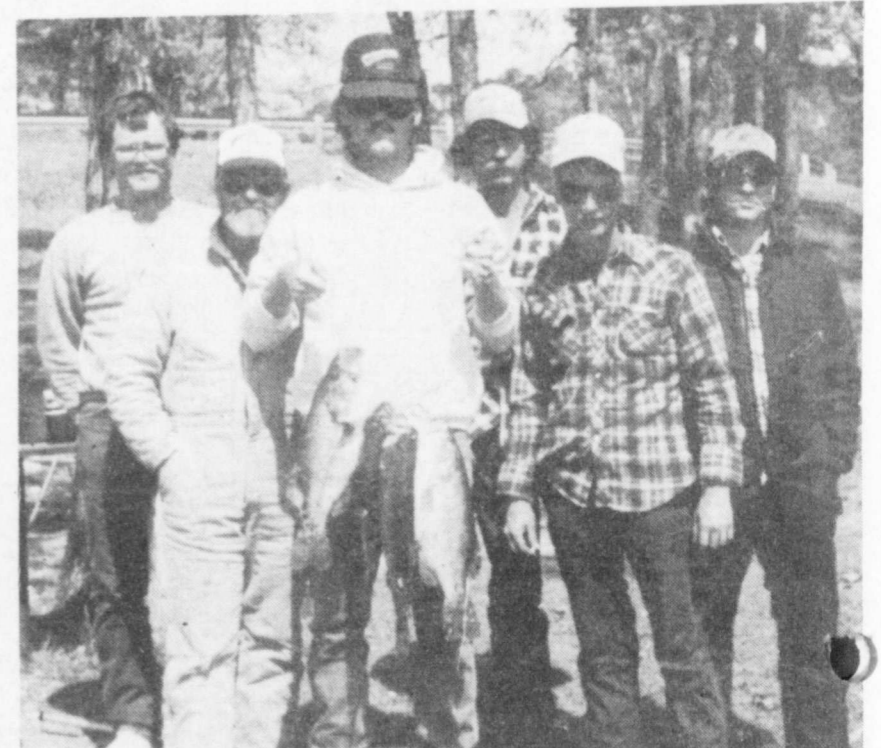
FIRST TOURNAMENT-The newly formed Deport Bass Club held their first tournament April 8-9 at Pat Mayse Lake. First