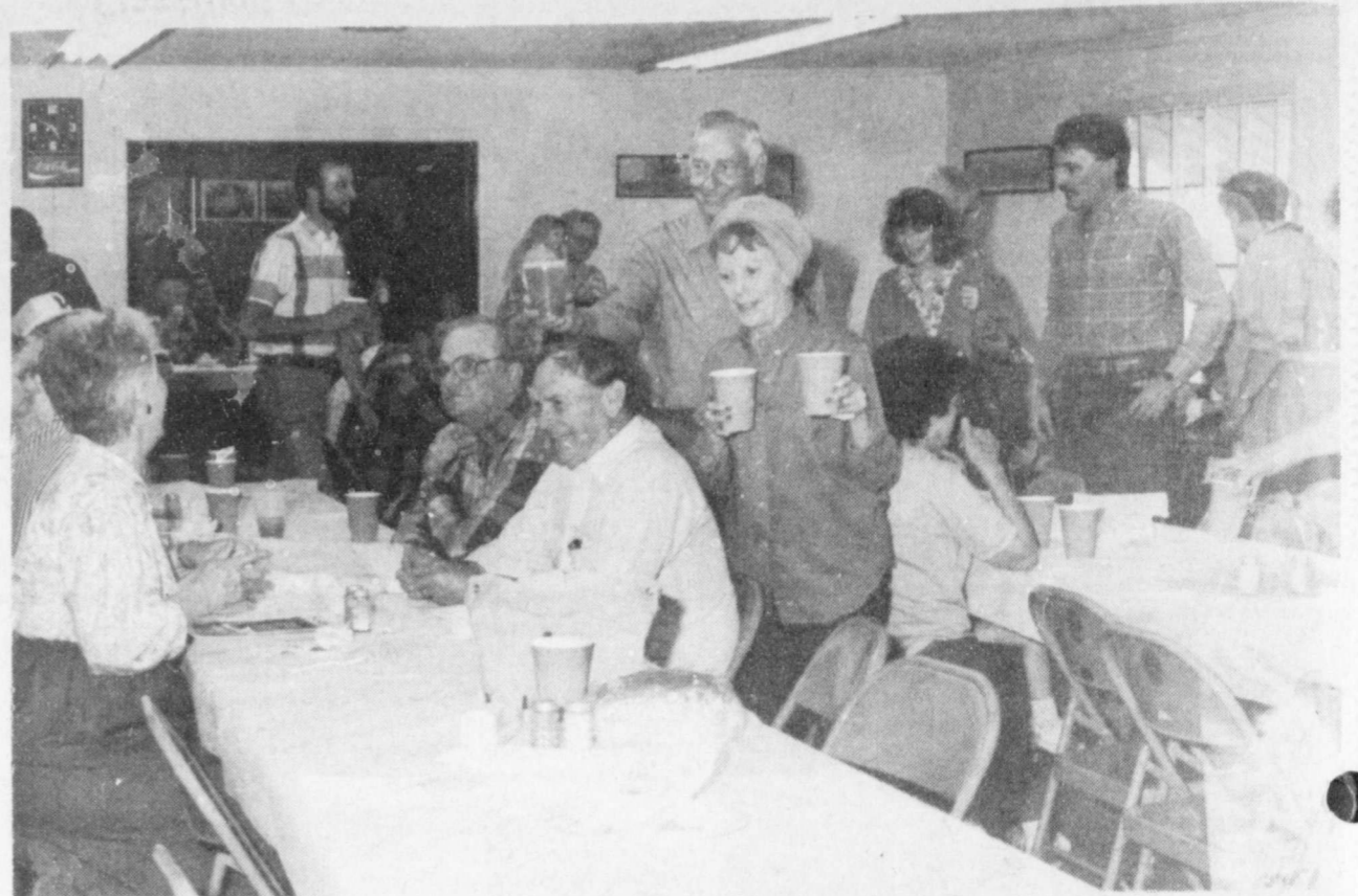
GOOD FUN-and food and fund-raising went along with the joint fund-raising effort put on by the