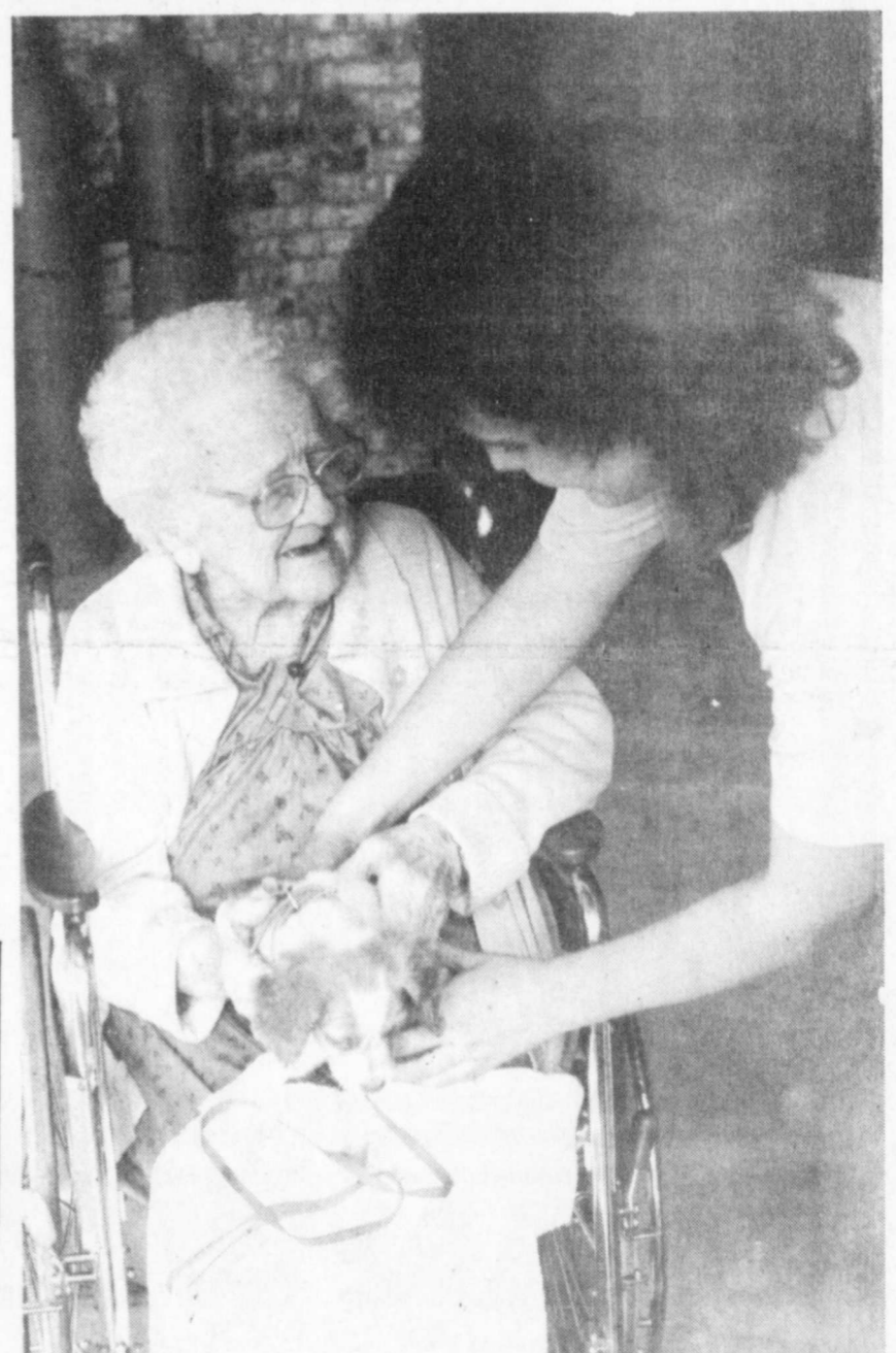
A PUP TO PET delighted a resident of Deport Nursing Home last week when Lamar County 4-H

The City of Deport has asked for a 90-day extension before Texas-New Mexico Power Company raises their rates so that the proposal can be further studied.