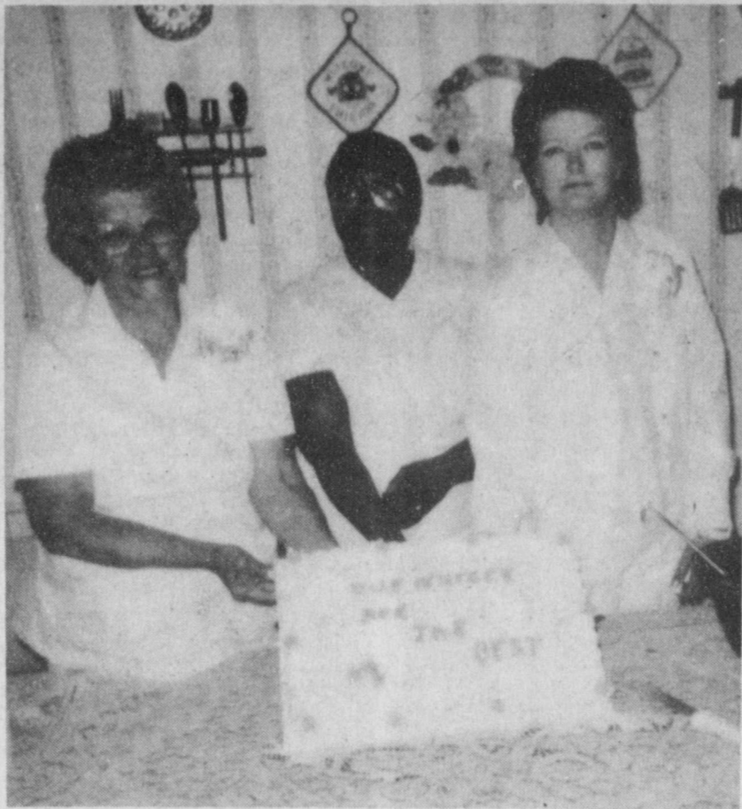
NURSE APPRECIATION Day on May 6 was held at the Deport Nursing Home. Corsages were presented to nurses and nurses aides by the residents to show their love and appreciation for the love