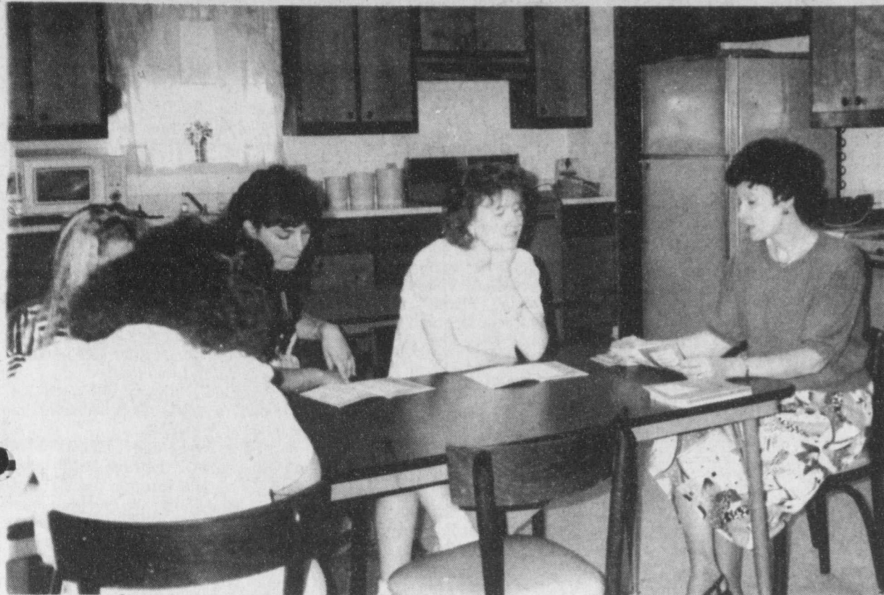
"CAREERS in the Electric Utility Industry" was the title of the program presented to the Prairiland FHA classes May 6, by