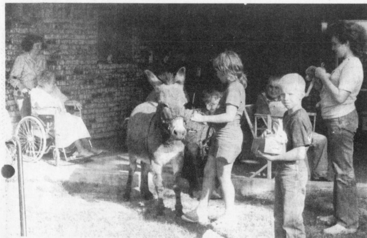
FROM DONKEY to rabbits, puppies and lambs, there was a wide variety of animals available for petting at the Deport Nursing Home last week as Lamar County 4-H'ers brought their pets to show residents.