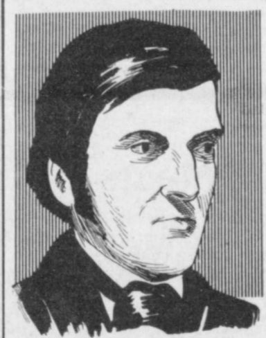
Our knowledge is the amassed thought and experience of innumerable minds. Ralph Waldo Emerson