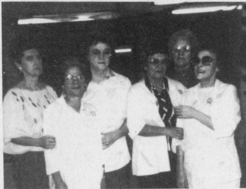
THE VFW LADIES Auxiliary Post 3990 of Reno volunteered on Monday to play bingo at the Deport