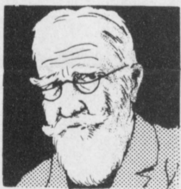
A life spent in making mistakes is not only more honorable but more useful than a life spent in doing nothing. George Bernard Shaw