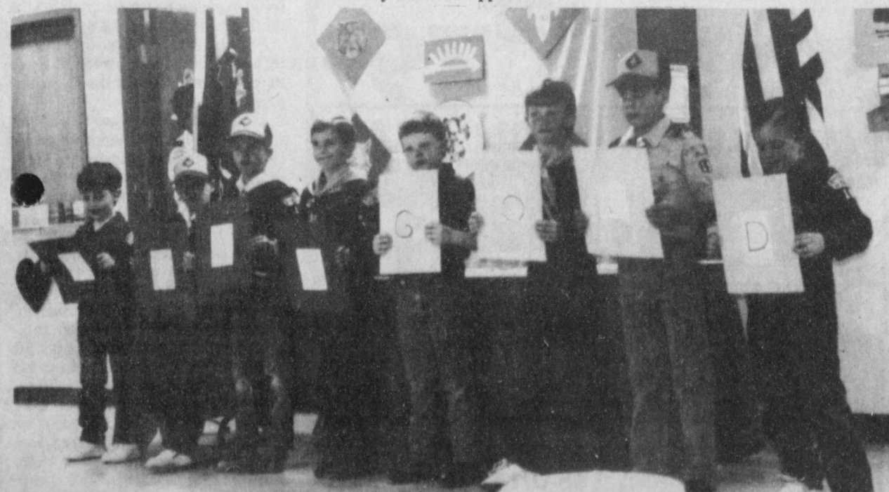
SKIT-A number of Cub Scouts put on a skit about "Blue and Gold" at the annual Cub Scout Blue and