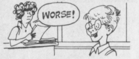
FAULTY Teacher: "Really, Billy, your handwriting gets worse every day!" Billy: "Well, Mrs. Jones, if I wrote better, you'd find fault with my spelling."