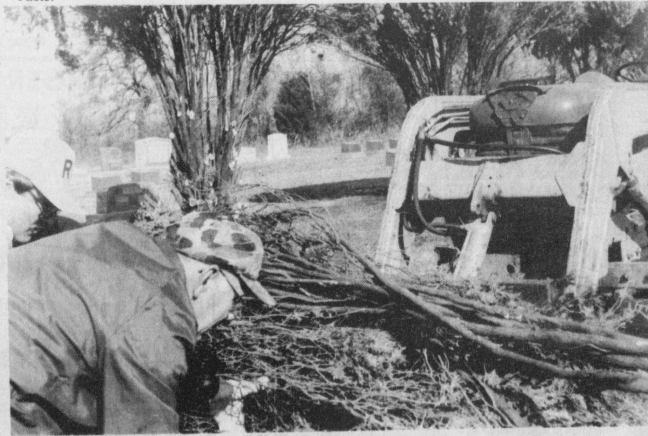
WORK DAY-The Deport Kiwanis, plus a number of interested citizens, trimmed 30 huge cedars at Highland Cemetery on Satur- day. They will do more work on