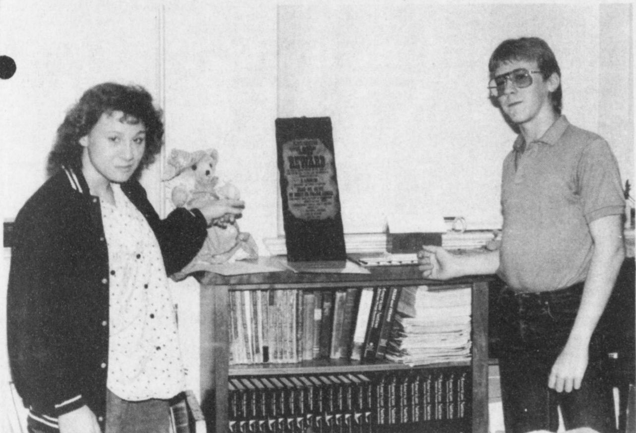
HISTORY -Deport seventh and eighth graders have prepared a variety of projects for Mrs.