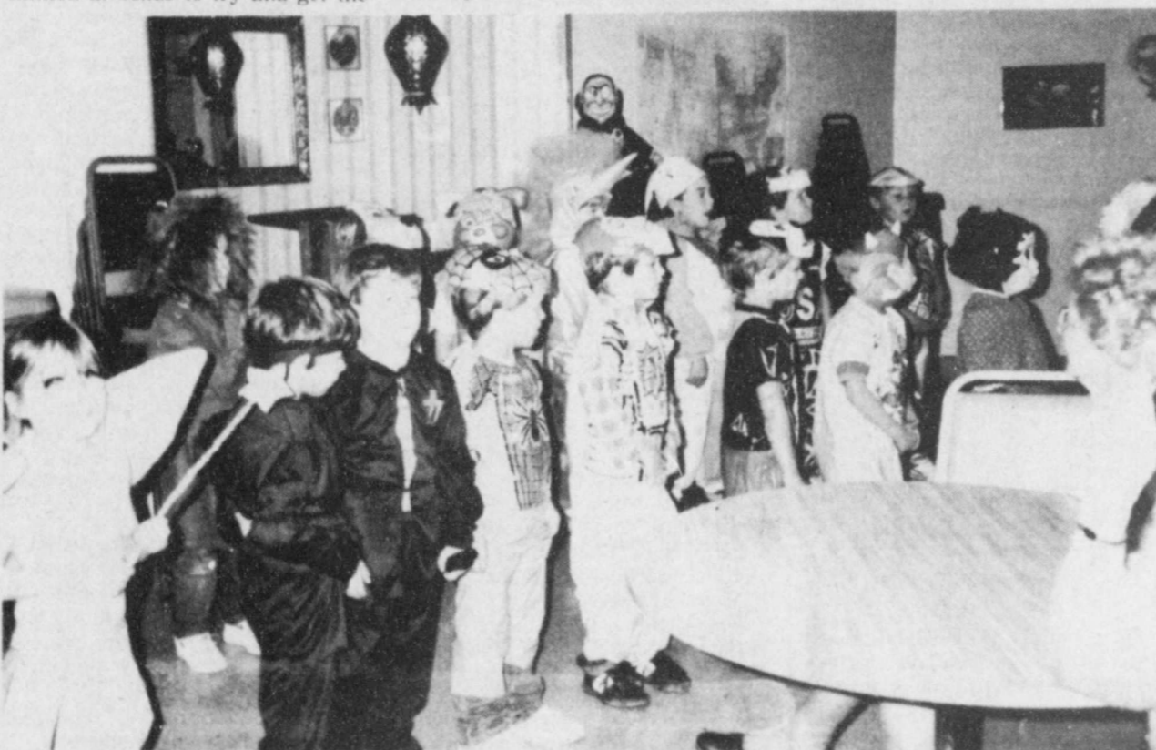
SPOOKS, GHOSTS and goblins presented fingerplays and Halloween songs for the Deport Nursing Home residents on October 30 in celebration of the Halloween holi-

A profile of the entire election seems to indicate that Texas voters were willing to vote for anything that they believed would help the state's economy, creating more jobs and attracting industry to the state.