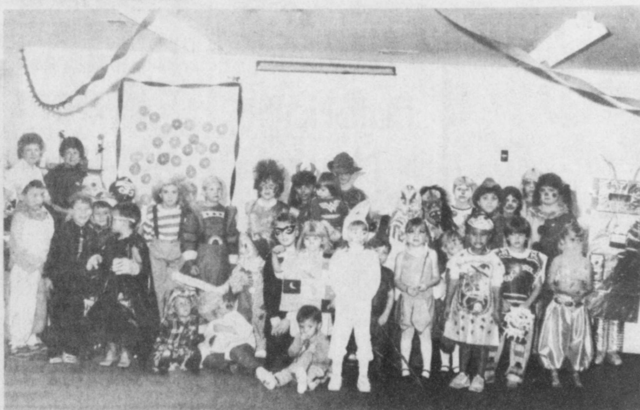
DEPORT FAITH Baptist Church had a fall festival last Friday night, with a costume party