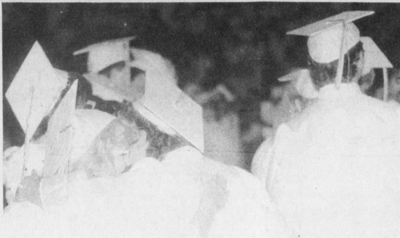
TEARS and hugs marked Prairiland High School graduation