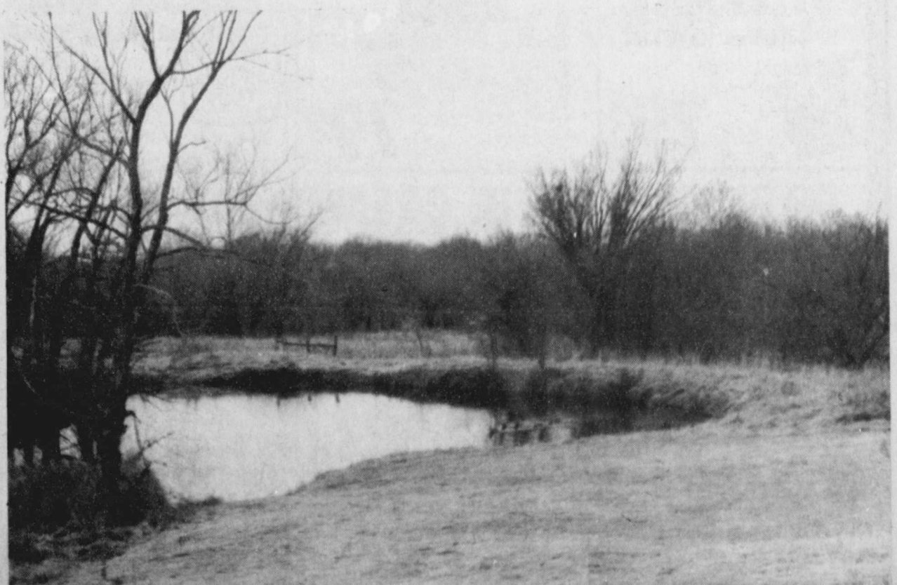
FROST AND COLD have been the normal thing this week, as the mercury hit in the twenties. A