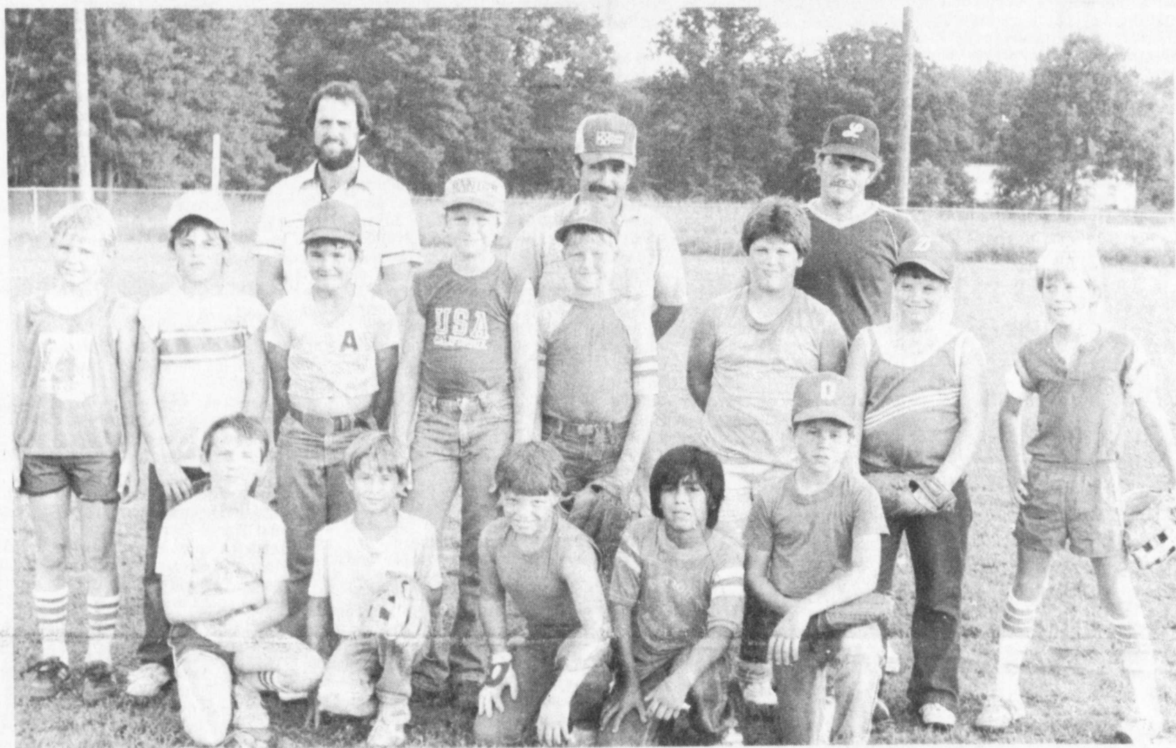
ALL STARS—The Red River West Minor League has chosen it's all star team for this season. It is composed of youngsters from four teams, and they were selected for their abilities by their