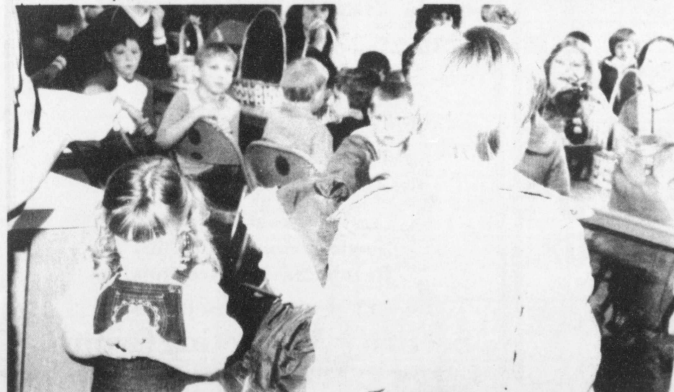
EAGER FACES were part of the first annual American Legion Egg Hunt sponsored by the

The Blossom GIRLS SOFTBALL TROUPTS will be held Saturday, April 16: ages 6-9 as of July 1 at 10 a.m.; ages 10-13 as of July 1 at 1 p.m.; ages 14-18 as of July 1 at 2 p.m. at the GIRLS SOFTBALL PARK.