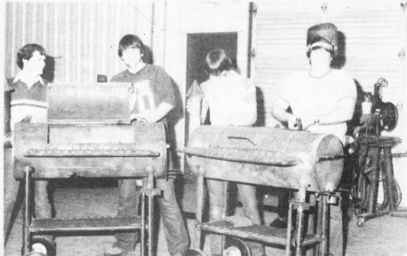
WORKING ON THE BBQ Grill—These members of Prairiland FFA are putting the finishing

A better way to spend a day, or even part of a day can be found around this neck of the woods right now!