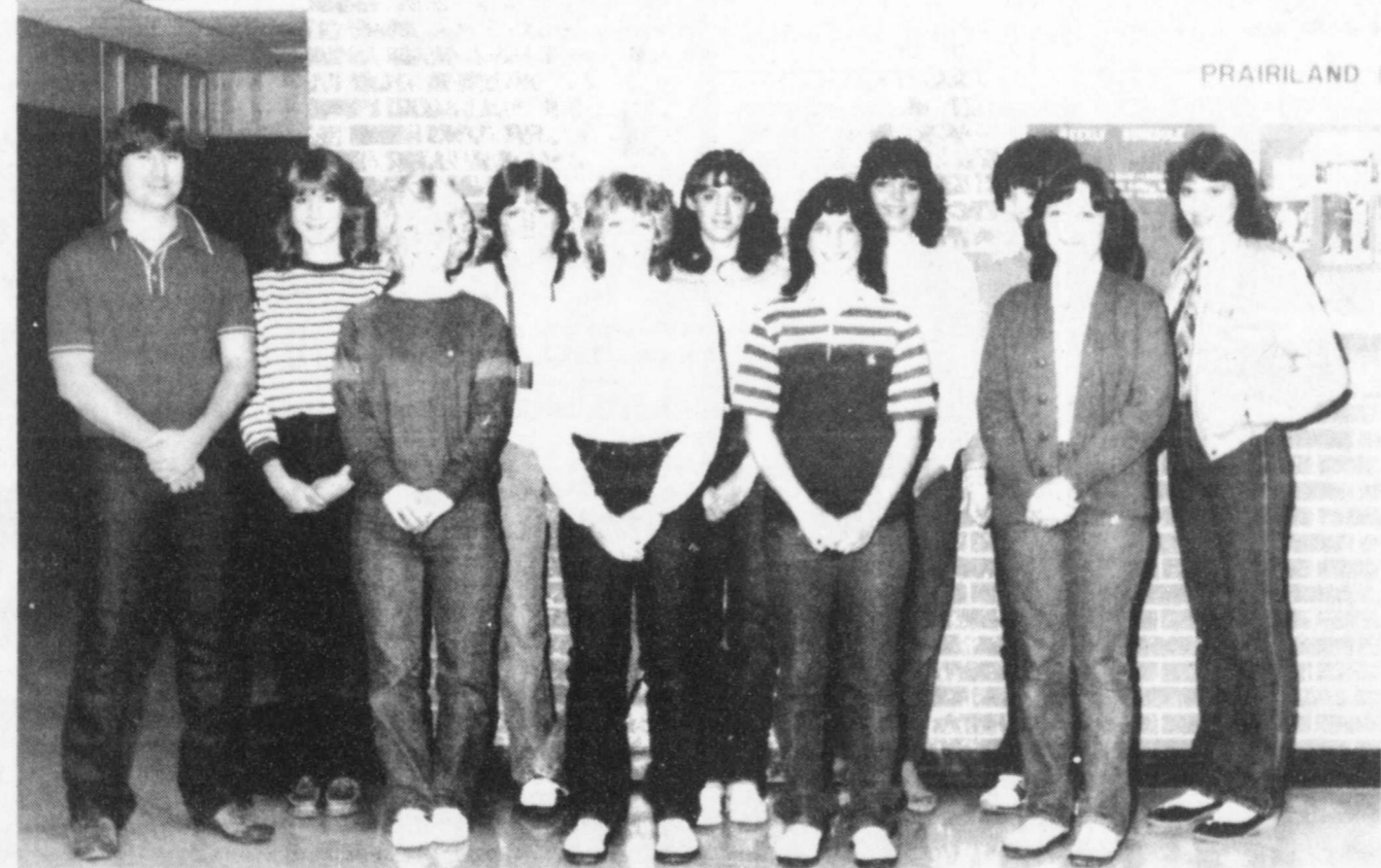
UIL AWARD WINNERS from Prairiland are, back

A total of 92 votes were cast in that election.