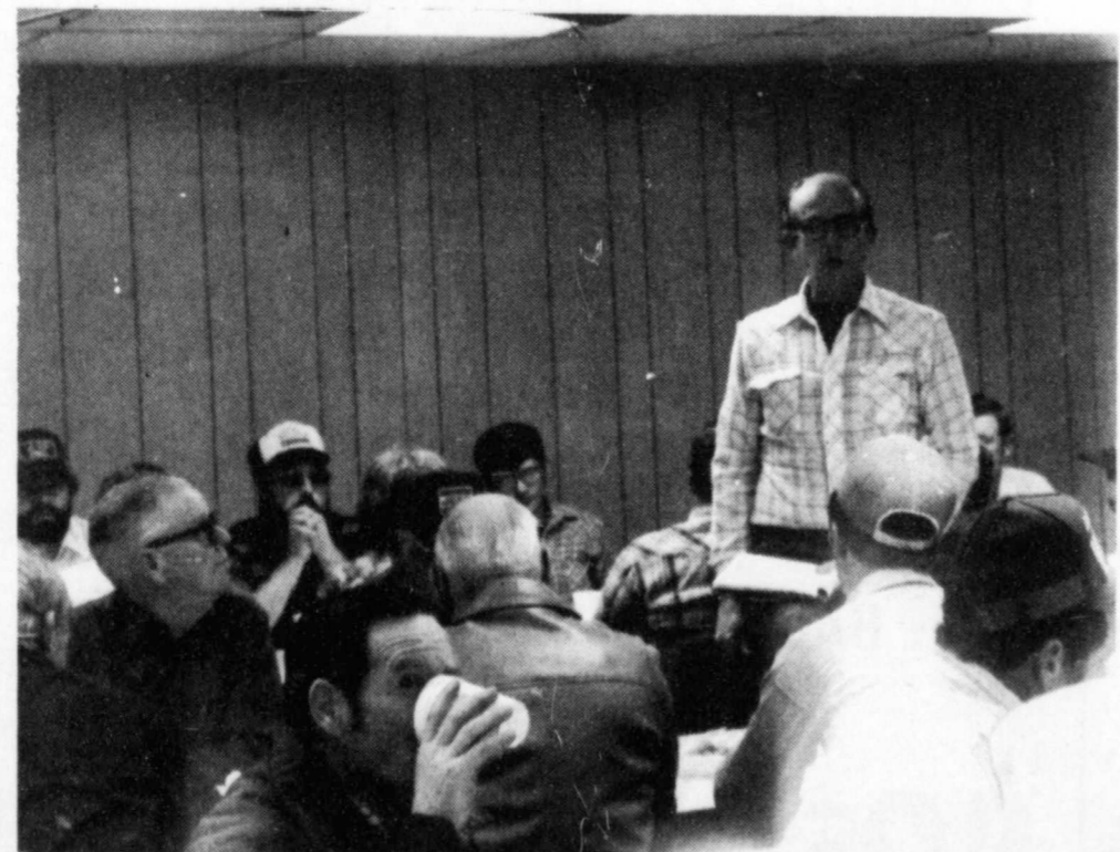
THE LAMAR County Volunteer Fire Fighters Association re-elected their 1982 officers to serve for 1983 at their quarterly meeting, held in Blossom Monday night.

The surest foundation of a manufacturing concern is quality. After that, and a long way after, comes cost. Andrew Carnegie