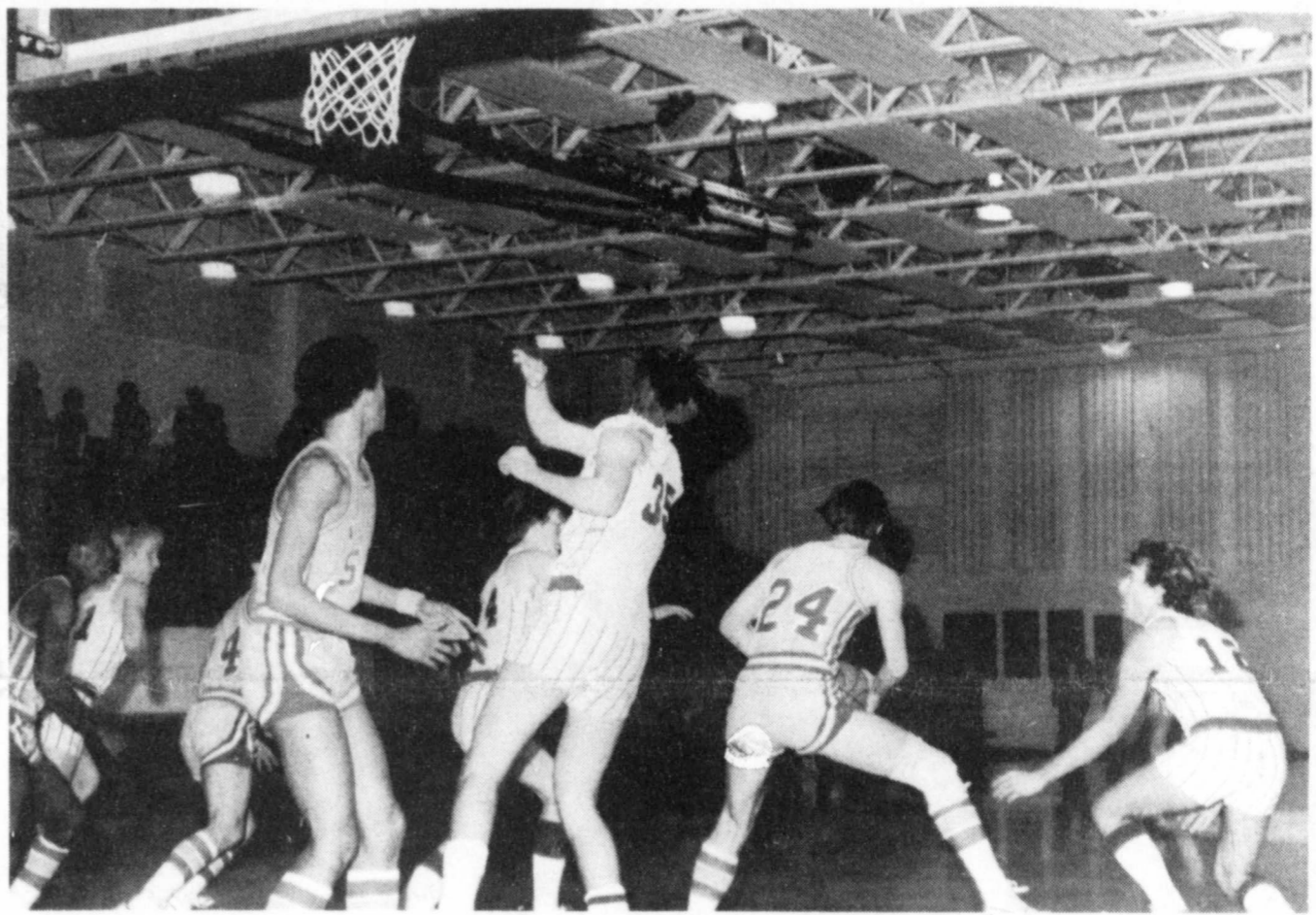
BOXED IN—The Sulphur Springs Wildcats found themselves with no place to go as the Prairiland Patriots kept on the pressure in exciting action last week. The Pats defeated the 'Cats by one point.