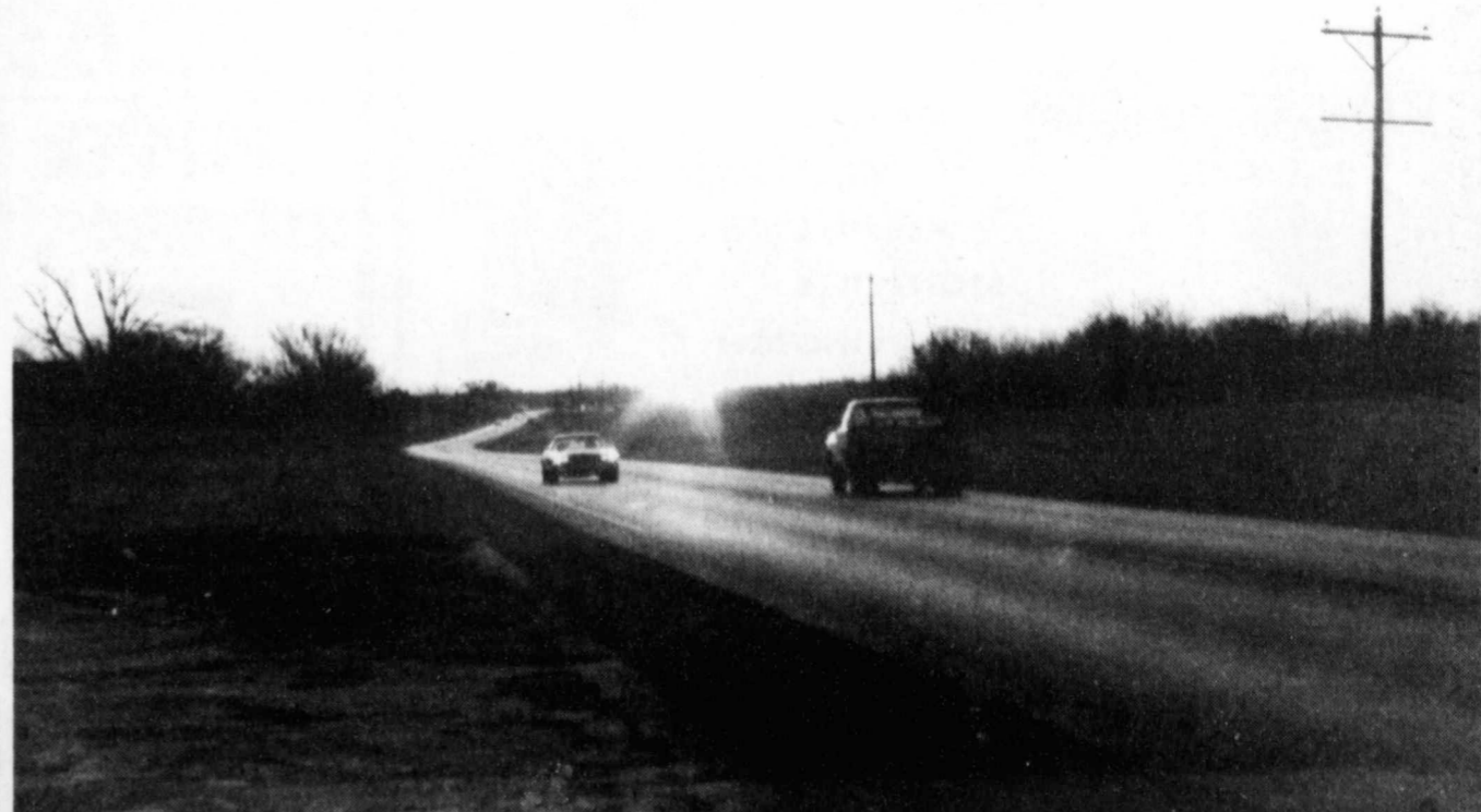
WELCOME SIGHT—After days of rain, weeks of heavy fog, the bright winter sunshine that arrived the other morning was a welcome sight. This scene, taken on Highway 271, showed the golden warmth spreading over the edge of the horizon.