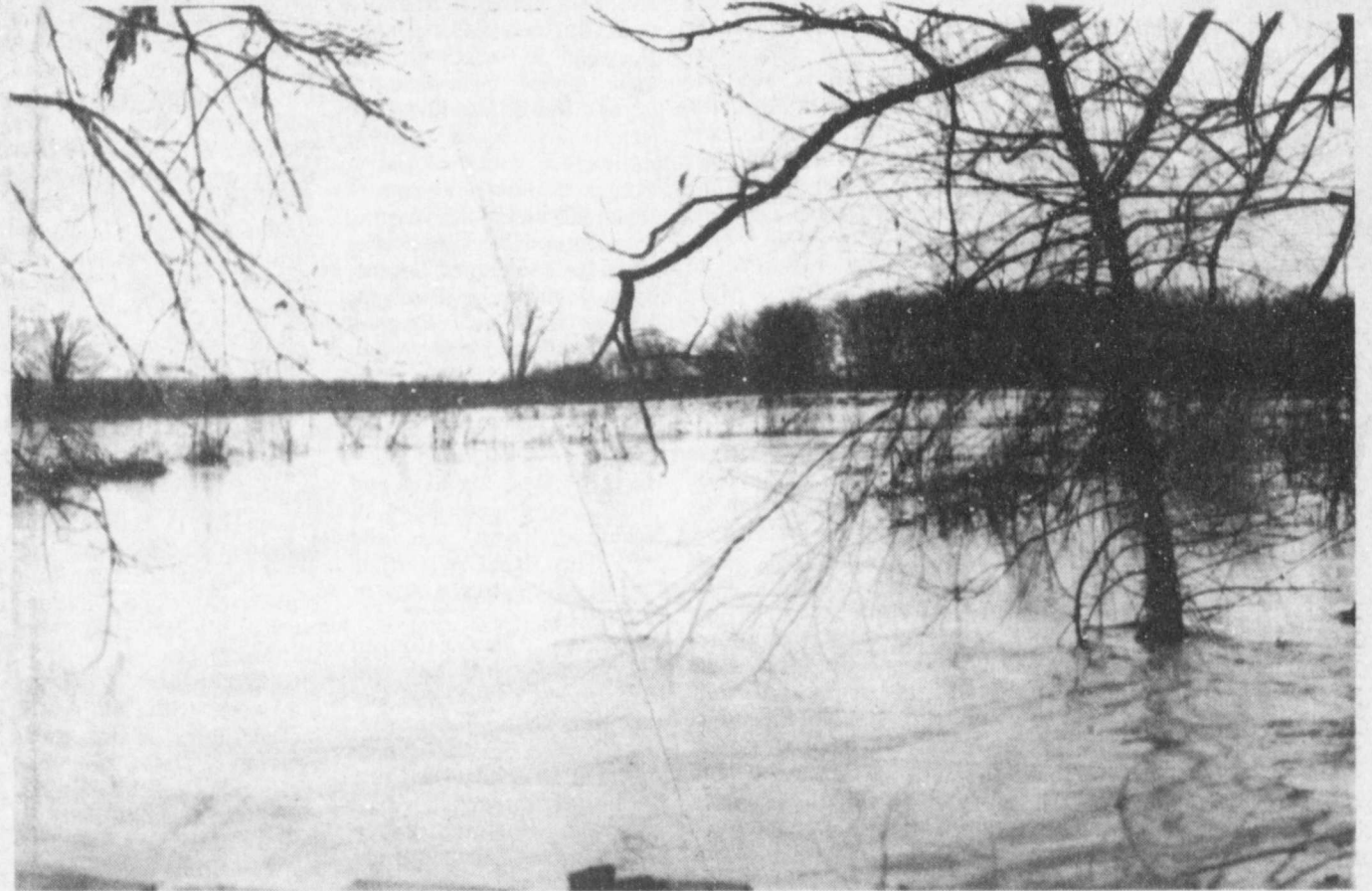
HIGH WATER near Blossom resulted in flooded pastures and impassable roads in some places. Already saturated ground has caused the recent rains to run off at a rapid pace.

Farmers have hopes of a spell of dry weather which will allow them to tend to their winter cultivation duties, but so far, the weathermen hold out little hope.