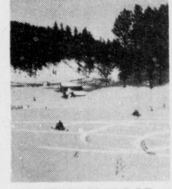
WINTERSPLENDOR... When snow falls in South Dakota's Black Hills, it leaves behind an unparalleled, tranquil beauty. A perfect area for snowmobiling, cross-country and Alpine skiing.

Attend the Church of your choice this Sunday