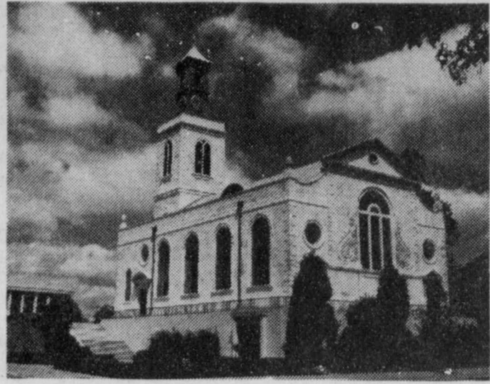
REASSEMBLED . . . The 12th century church of St. Mary Aldermanbury was brought from London in pieces and reassembled on the campus of Westminster College in Fulton, Mo.