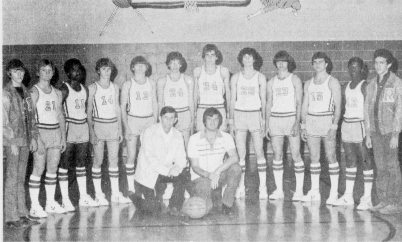
RIVERCREST-Varsity boys won second place in the Holiday Tournament at Leonard. All the boys

played well but were defeated in the final game by Honey Grove. The