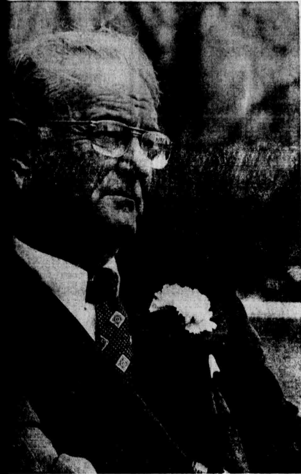
Lyndon B. Johnson

Shortly after the inaugural ceremony the parade began down South Congress Avenue. Governor Briscoe and Lt. Gov. Hobby led the "parade" and mounted the reviewing stand across the street from the Capitol to view the long string of bands and floats.