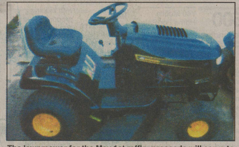
The lawnmower for the May 1st raffle; proceeds will serve to replace the quick attack truck in the Fire Department.

All proceeds will go towards the new equipment at the Volunteer Fire Department.