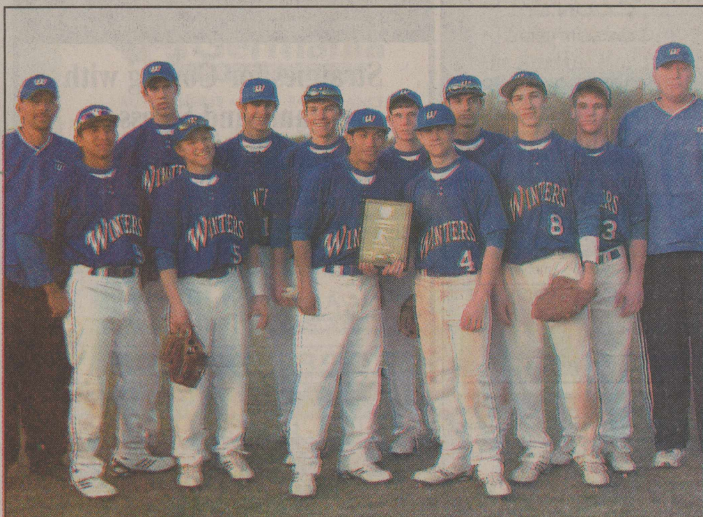
The Winters High School baseball team won the Blizzards baseball tournament Friday, Feb. 26.