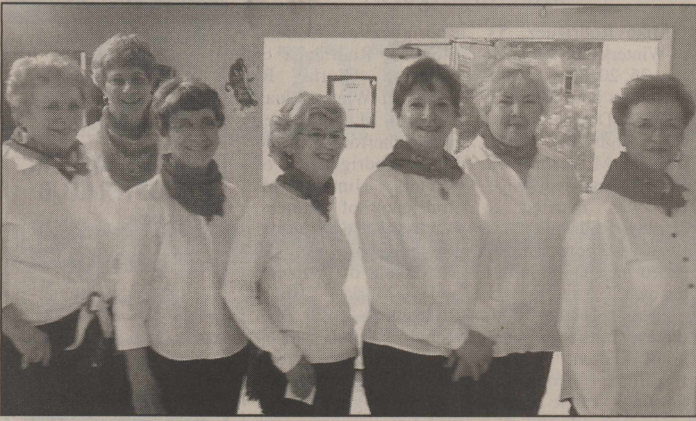
Line dancers entertaining the residents at Runnels County Rehab and Nursing.