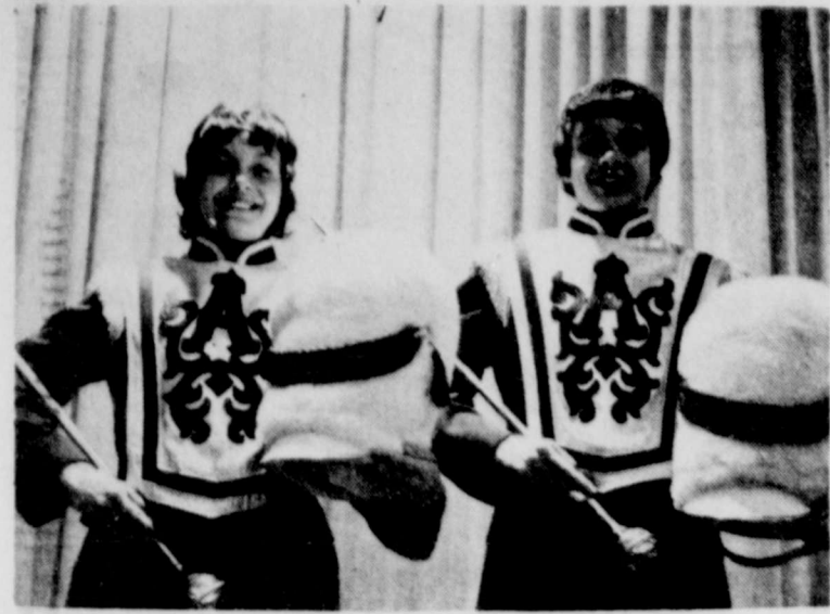
Drum Majors For 1973-74 Antelope Band