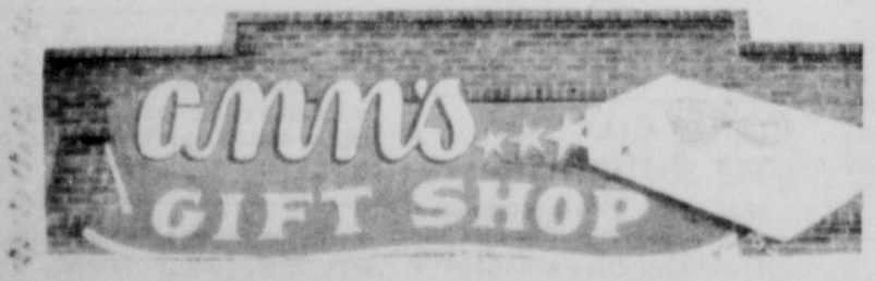
310 Main - Abernathy - 298-4051

Make your gift selections for these and other gift occasions at