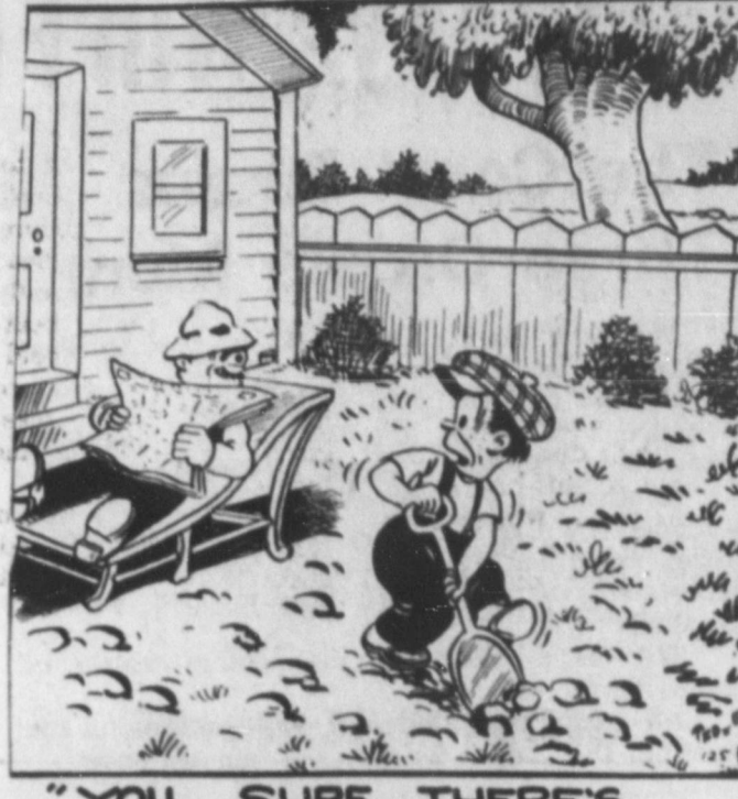
"YOU SURE THERE'S GOLD BURIED OUT HERE?"