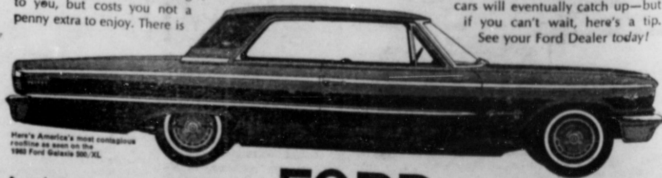
Here's America's most contagious routine as seen on the 1963 Ford Galaxie 500 XL.

Only Ford offers all these advantages now. Other cars will eventually catch up—but if you can't wait, here's a tip. See your Ford Dealer today!